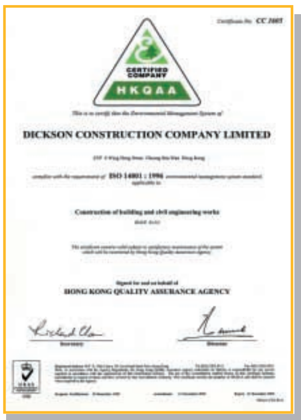
ISO 14001 Environmental Management System 環境管理體系