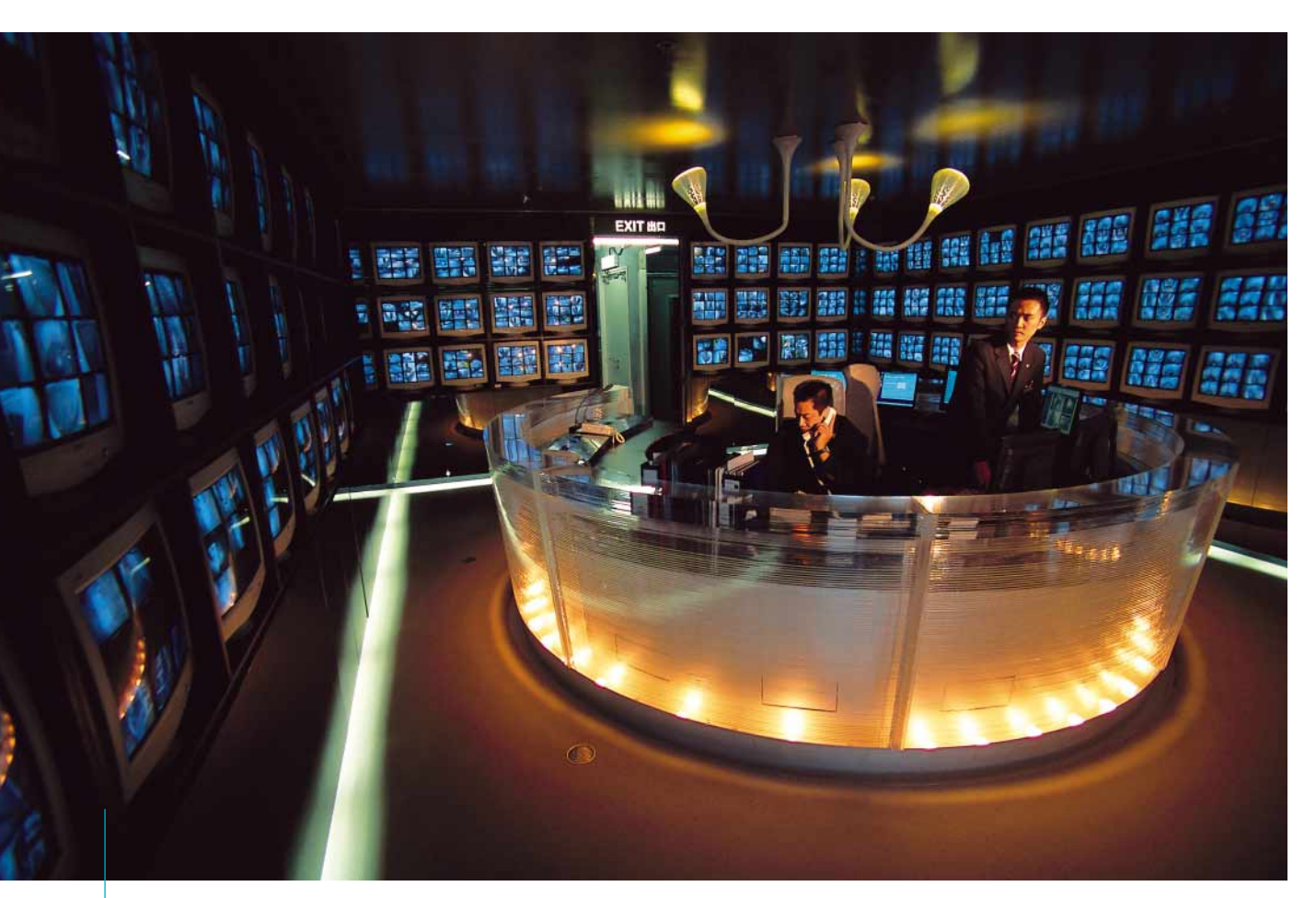
The intelligent heart of an intelligent building – Two IFC's control centre