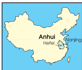
Highway Projects Map of Anhui Expressway Company Limited