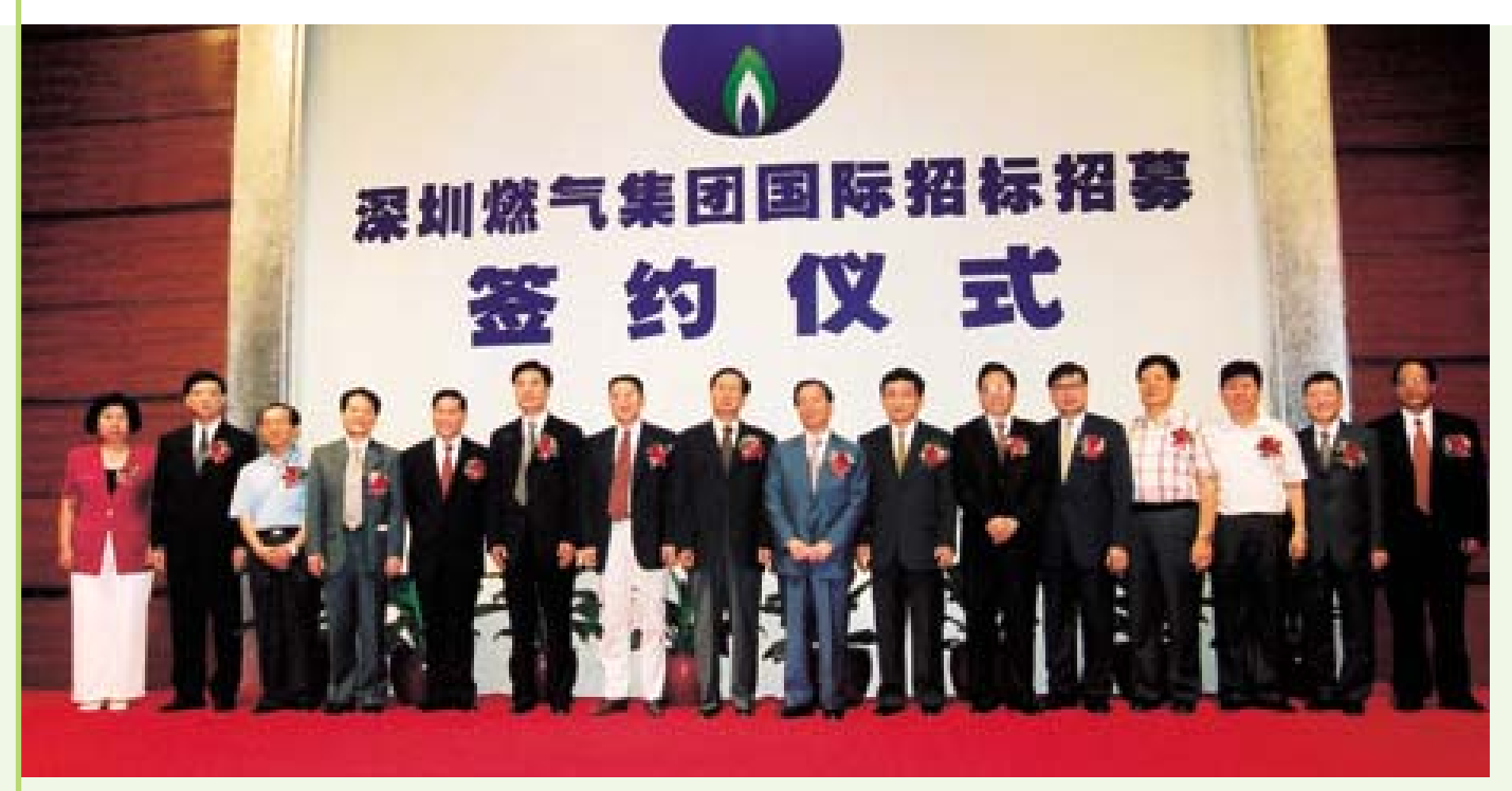
Towngas' city piped gas project framework agreement with Shenzhen Gas Corporation signified a major step in the establishment of our business in the mainland as it will create synergies with our existing and future joint ventures in the Pearl River Delta.

intensifying development of these kinds of gas applications. We will equally continue to enhance our customer care, safety and service standards as these are proving to be highly effective in cultivating loyalty to the Towngas brand. Market prospects of natural gas usage for transport in China are also being explored.