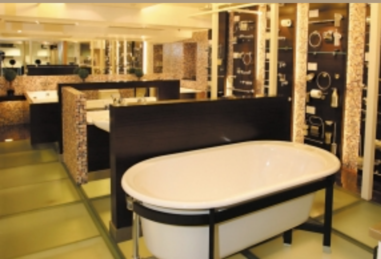
Kohler – the favourite choice of bathroom fixtures in Hong Kong 科勒－香港衛浴潔具極受歡迎的選擇