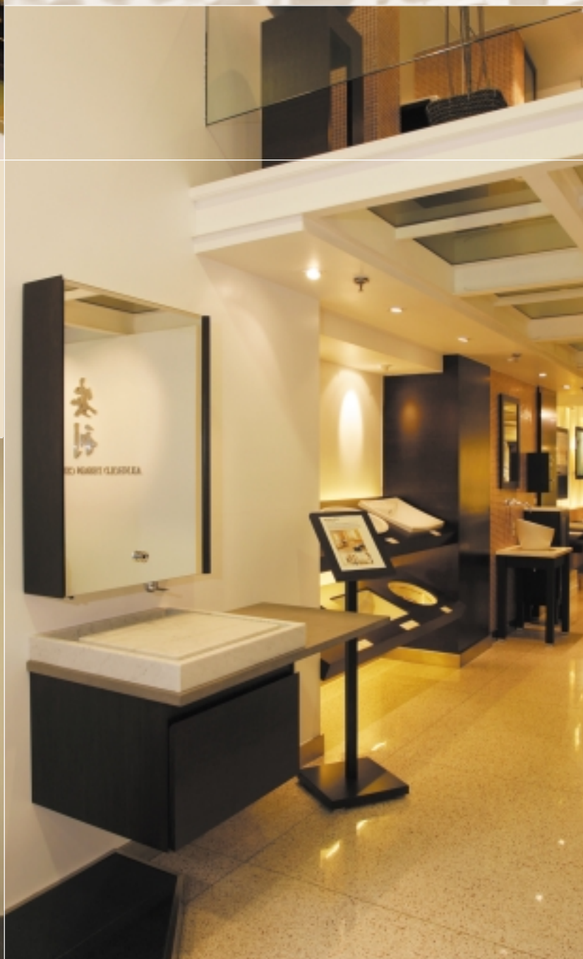
French design cues for the Kohler Escale Suite 科勒艾思格爾套間，表現出法國式的設計