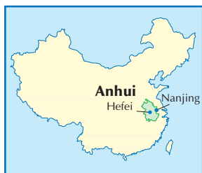
Highway Projects Map of Anhui Expressway Company Limited