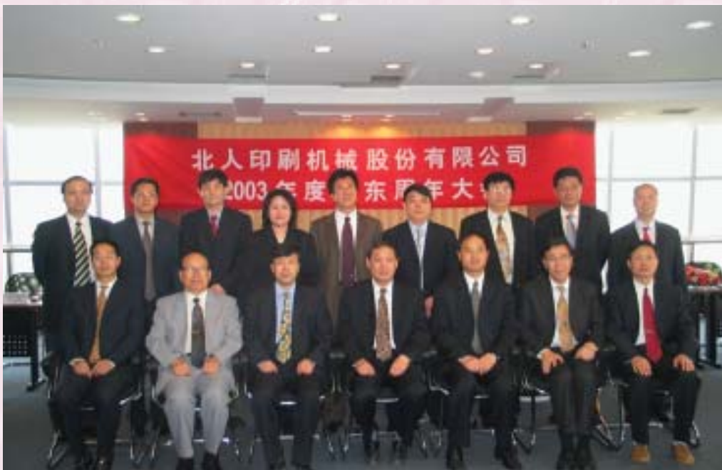
本公司董事、監事、高級管理人員在2003年度股東大會後合影 Directors, Supervisors and Senior Management of the Company took a group photo following the Annual General Meeting 2003.

As of 31 December 2004, the Company did not issue any convertible securities, options, warrants or any other similar right.