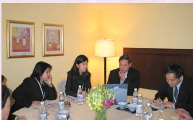
2004年本公司加強與投資者的溝通，參加了多次基金經理見面會，圖為公司高層與投資基金經理見面會場 In 2004, the Company enhanced communications with investors and attended various meetings with fund managers. Pictured is the meeting between the management of the Company and investment fund managers.

Opening price at beginning of year: Rmb6.18 Closing price at end of year: Rmb5.40 Highest price: Rmb7.99 Lowest price: Rmb4.12