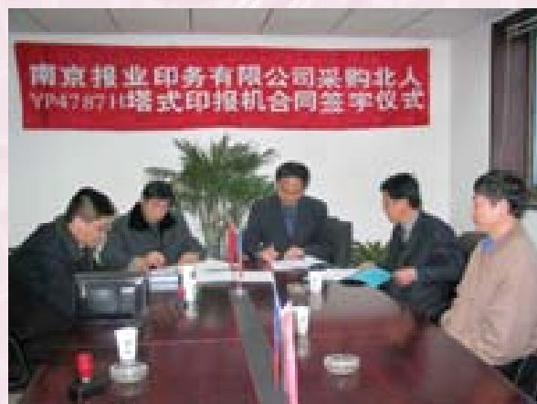
2004年，本公司塔式印報機出現供不應求的局面，圖為塔式印報機合同簽字儀式 In 2004, the supply of tower press failed to meet with its demand. Pictured is the tower press contract signing ceremony.