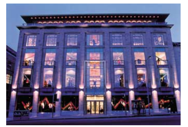
The Harvey Nichols store in Edinburgh, United Kingdom. 位於英國愛丁堡的「夏菲尼高」百貨公司。