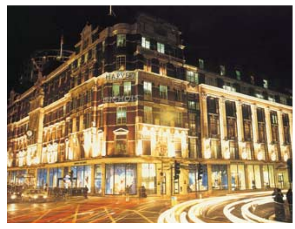
The Harvey Nichols store at Knightsbridge, London, United Kingdom. 位於英國倫敦 Knightsbridge 的「夏菲尼高」百貨公司。

The strong performance of the Group's 49 shops in Hong Kong coupled with the three Hong Kong Seibu stores and the opening of the Harvey Nichols store, places the Group in an ideal position to capitalise on the strong growth of the Hong Kong economy.