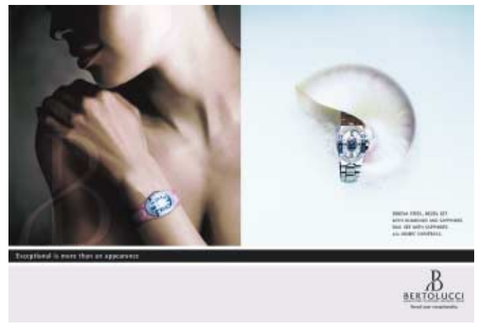
Bertolucci 'Serena' watches. 「Bertolucci」的「Serena」系列手錶。