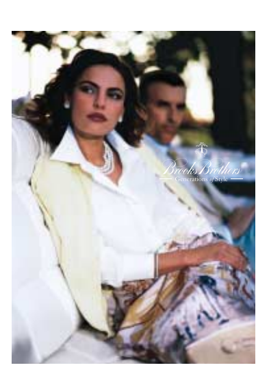
Brooks Brothers fashion. 「Brooks Brothers」時裝。