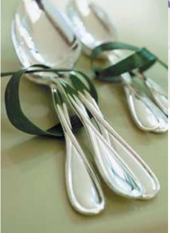
Christofle tableware. 「Christofle」 餐具。