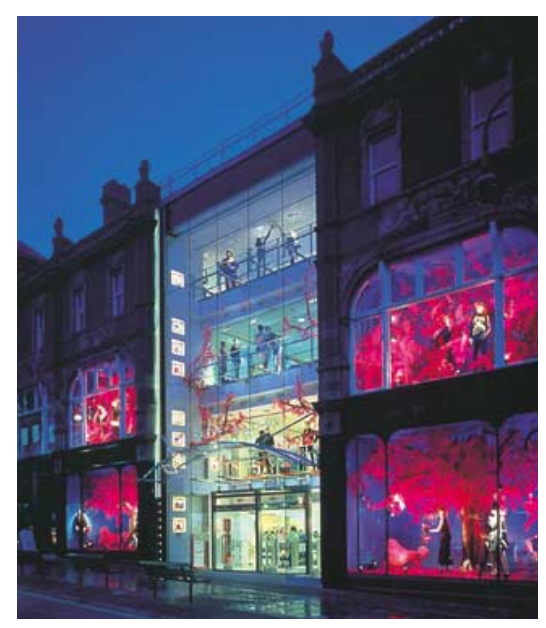
The Harvey Nichols store in Leeds, United Kingdom. 位於英國列斯的「夏菲尼高」百貨公司。