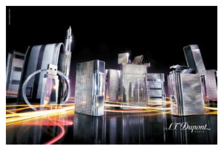
S.T. Dupont 'Diamond Head' lighters and writing instruments collection. S.T. Dupont「Diamond Head」打火機及書寫文具系列。

The Group's retail network at 31st March, 2005 totalled 379 shops and shop-in-shops. This comprised 49 in Hong Kong, 140 in China, 143 in Taiwan and 47 in Singapore, Malaysia and the Philippines.