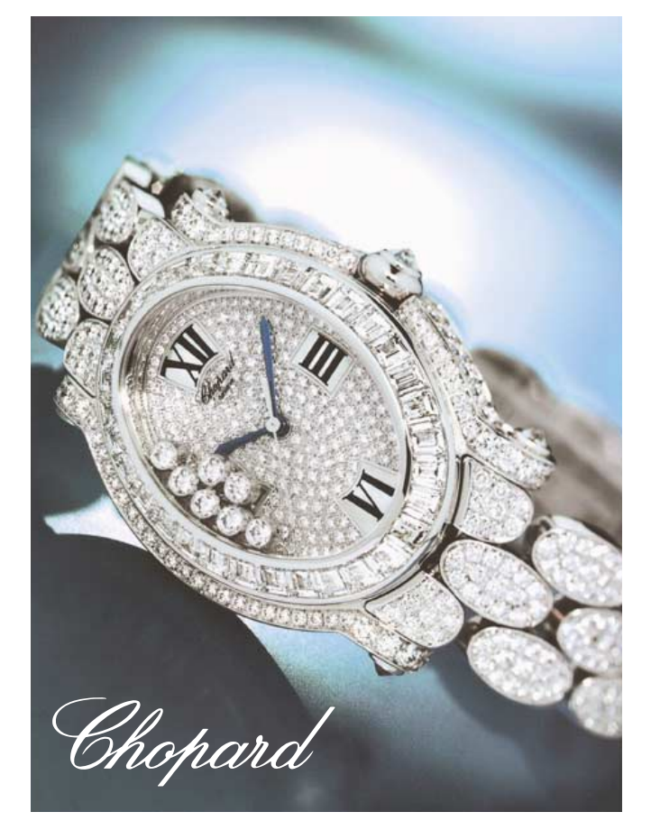
Luxury watch by Chopard. 「蕭邦」名貴手錶。