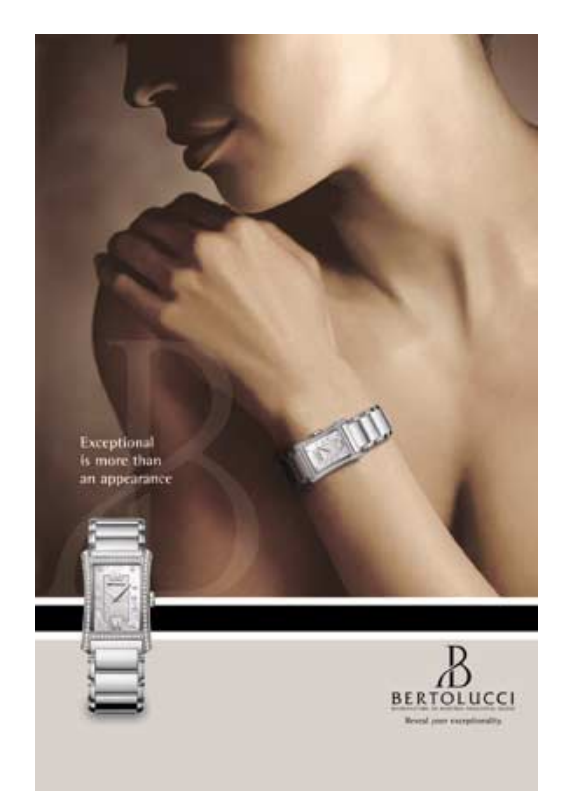
Bertolucci 'Fascino' watches. 「Bertolucci」的「Fascino」系列手錶。

The Group considers Bertolucci to be a tremendously undervalued asset with very significant upside potential both in terms of profits and capital appreciation once the Group has completed the implementation of its development strategies in the years ahead.