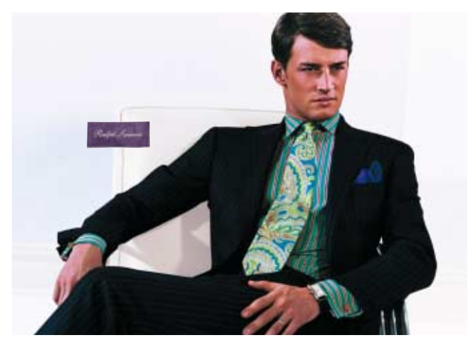
Ralph Lauren Purple Label menswear. 「Ralph Lauren」的「Purple Label」男士服裝。