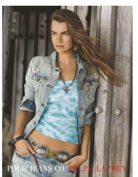
Polo Jeans Company womenswear. 「Polo Jeans Company」 女士服裝。