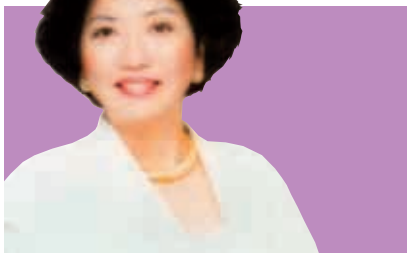
Independent Non-Executive Director