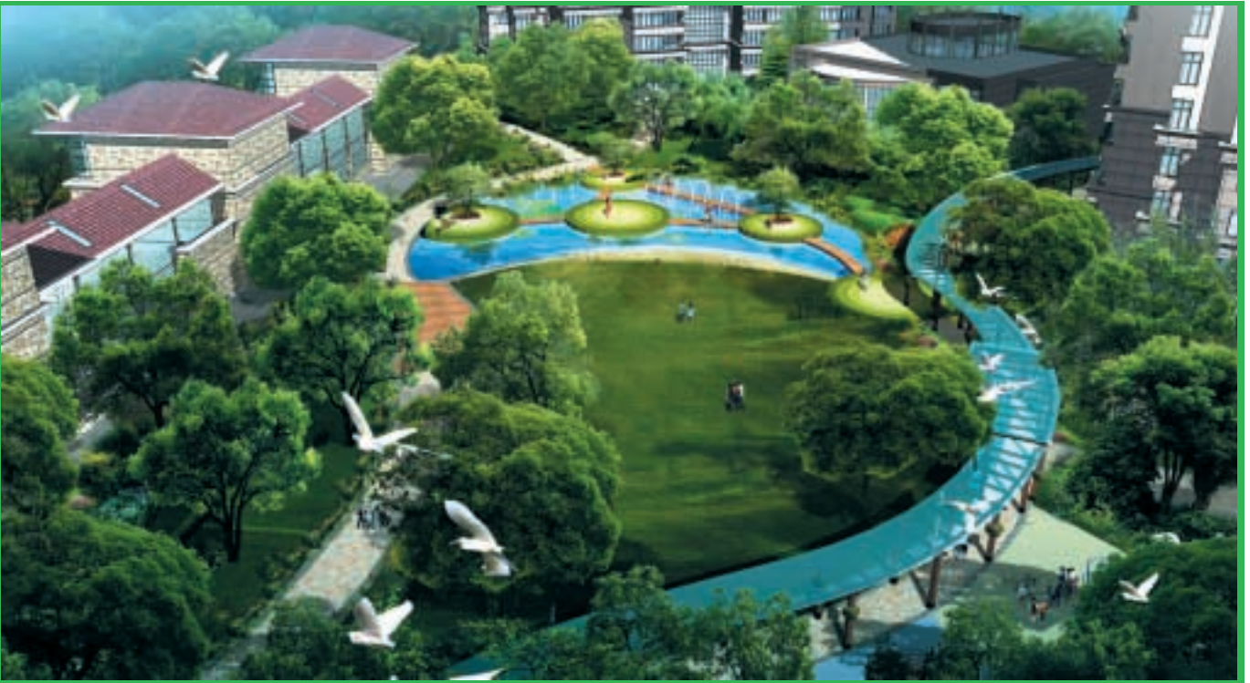
Albany (雅賓利) Oasis Garden – Central CLD of City