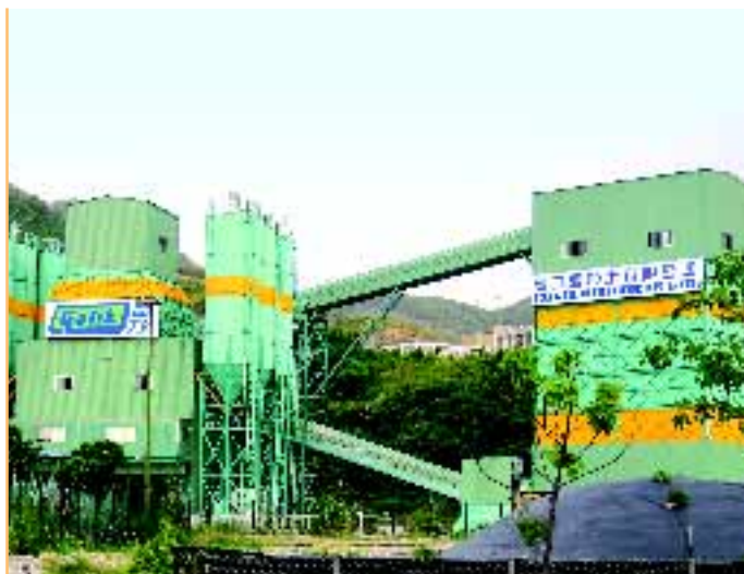
Ready Mixed Concrete Plant in Siu Ho Wan, Lantau, Hong Kong