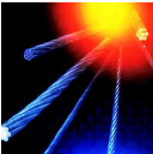
Wire Ropes and Pre-Stressed Strands