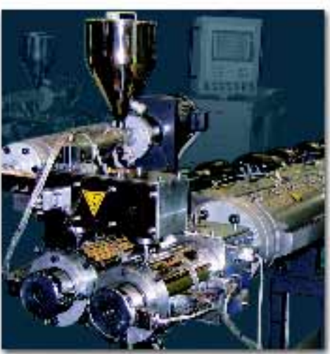
Double Strand Extrusion Line