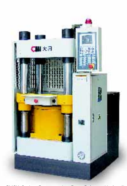
CMSX Series Computerize Four-Column Hydraulic Press

As for prospects in 2006, the Mainland, as the world's factory and a vibrant economy, is expected to witness rise in both investment and domestic spending. Intentions to invest in plastics processing and sheet-metal working machinery will improve when prices of plastic resins and steel stabilize. In anticipation of the likely accelerated growth of the Mainland market for medium to up-market injection moulding machines, we will scale up the production of these series at our plants in Wuxi, China, in collaboration with Japan UBE Industries Ltd to meet market needs. Turning to our other products, fully closed-loop plastic injection moulding machines, high speed CNC turret punch and high productivity multi-layer blow-moulding machines are expected to sell significantly better than in 2005. All in all, although competition will remain fierce, the Group is cautiously optimistic about the outlook of its machinery business.