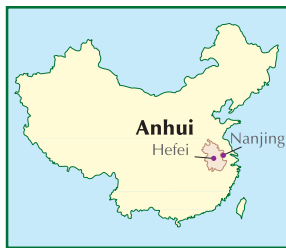
Highway Projects Map of Anhui Expressway Company Limited