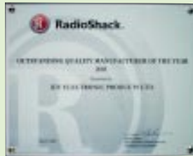
RadioShack Outstanding Quality Manufacturer of the Year 2005