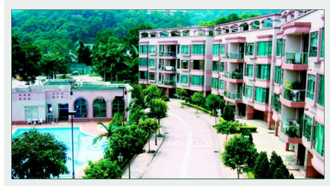
Emerald Palace 叠翠豪庭