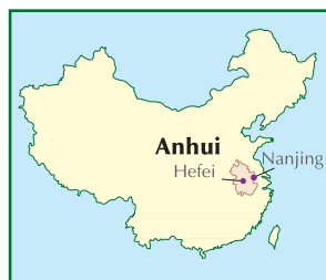
Highway Projects Map of Anhui Expressway Company Limited