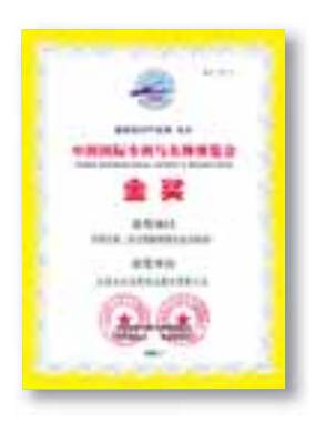
Gold Medal in "The Third Chinese International Patented and Famous Brands Exhibition"