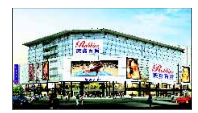
Robbinz Department Store in Tianjin, the PRC

The PRC economy has continued to sustain impressive growth, with a GDP growth rate of 10.5 per cent. in 2006. With the growth in purchasing powers and improvements in living standards, it is expected that retail business in the PRC benefit will grow. Drawing on the Group's retail experience, the LCR Group would expand its retail business in the PRC through the newly established department store chain "Robbinz". "Robbinz" is positioned to serve the fast growing mid-to-high-end consumer segment providing customers with one stop shopping service. In December 2006, the LCR Group entered into a 20-year lease for leasing of a shopping mall space in Chengdu, Sichuan Province, the PRC with a gross floor area of approximately 28,000 square metres. In April 2007, the LCR Group also entered into a 20-year lease for leasing of a commercial property in Tianjin, the PRC with a gross floor area of approximately 98,000 square metres. Both premises are situated at a prime location in the city centre. The LCR Group intends to open more shopping centres and/or department stores under the "Robbinz" brand in municipalities and provincial capitals of the PRC in the near future.