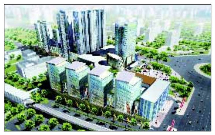
Lippo Tower in Chengdu, the PRC