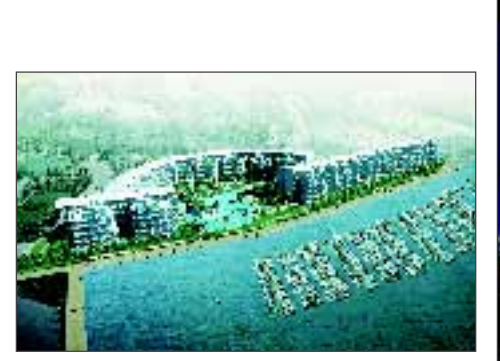
Marina Collection, property development project at Sentosa Cove, Sentosa Island, Singapore