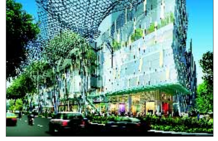
New Mandarin Gallery in Singapore

Lippo ASM Asia Property LP ("LAAP"), a limited partnership of which a wholly-owned subsidiary of HCL is the founding limited partner, carries the investment objective of investing in real estate in the East Asia region, in particular in Singapore, Malaysia, Thailand, Indonesia, China (including Hong Kong and Macau) and Japan. It is intended that LAAP will seek long-term capital growth through a well-diversified portfolio of investments in income producing property projects. The Directors considered that participation in LAAP would provide an effective medium for the HCL Group to exploit investment opportunities in the Asian property markets.