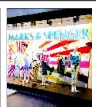
Marks & Spencer in Singapore