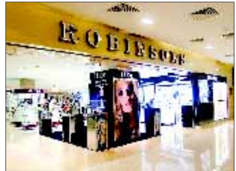
Robinsons in Singapore