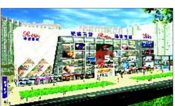
Robbinz Department Store in Chengdu, the PRC