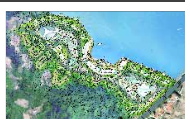
Proposed master plan of the Woonbook Project