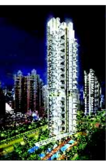
Property development project at Kim Seng Plaza, Kim Seng Road, Singapore

In April 2006, the HCL Group participated, as a majority shareholder, in a joint venture to purchase a total of twenty two strata lots of a commercial building located at 79 Anson Road in Singapore (the "Anson Road Property") for S$95 million. The Anson Road Property is situated within the Central Business District and comprises a total strata area of approximately 10,909 square metres. The rental income from the Anson Road Property provides an additional recurrent and stable source of income. Reflecting the limited supply but increasing demand for commercial buildings in Singapore, the potential for value appreciation on this property is strong.