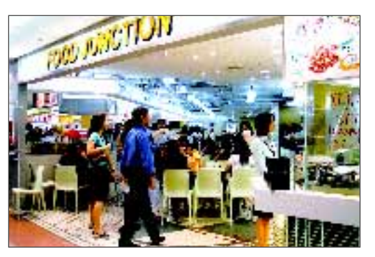
A food court operated by Food Junction