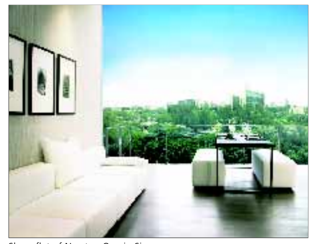
Show flat of Newton One in Singapore