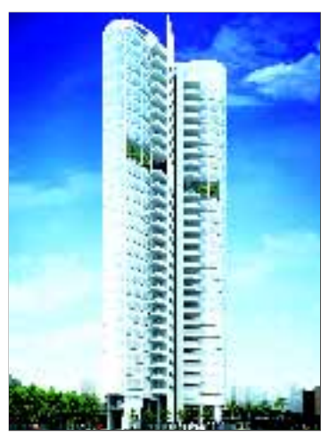
Newton One in Singapore