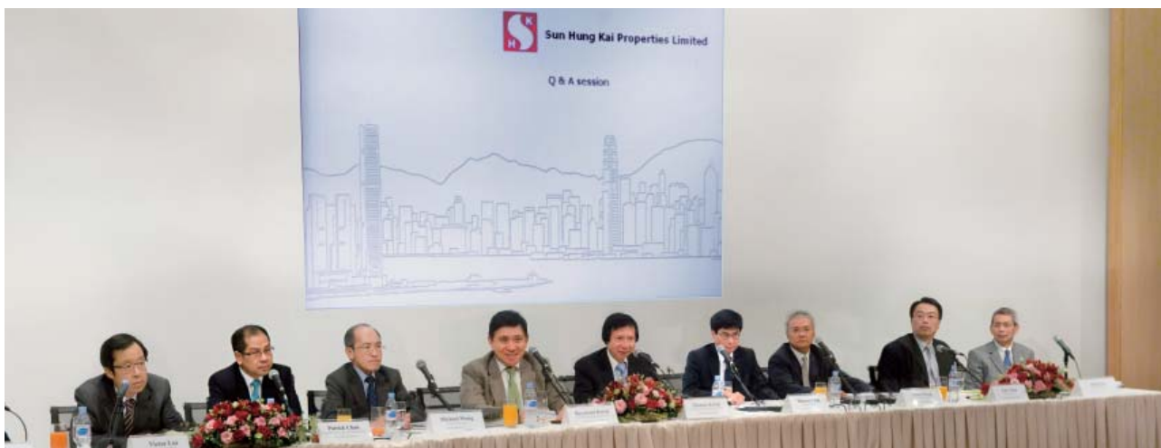
Briefings for the investment community after results announcements are an effective way to maintain good investor relations.