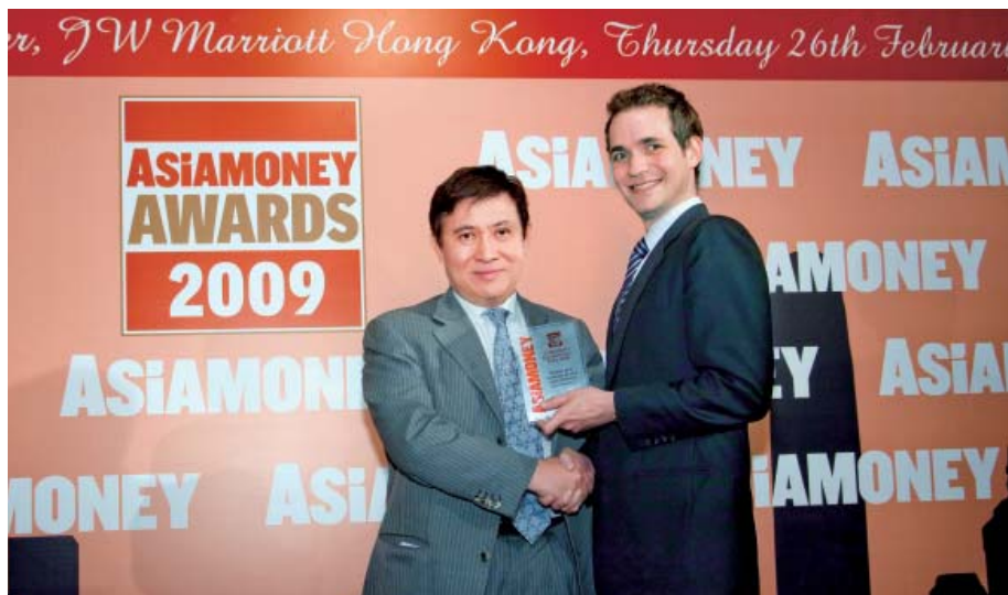
Vice Chairman and Managing Director Raymond Kwok (left) receives the Best Company in Asia for Corporate Governance award from Asiamoney.

Staying at the forefront of best investor relations is a priority for the Group, and it maintains high transparency and effective accountability mechanisms in every aspect of its business.