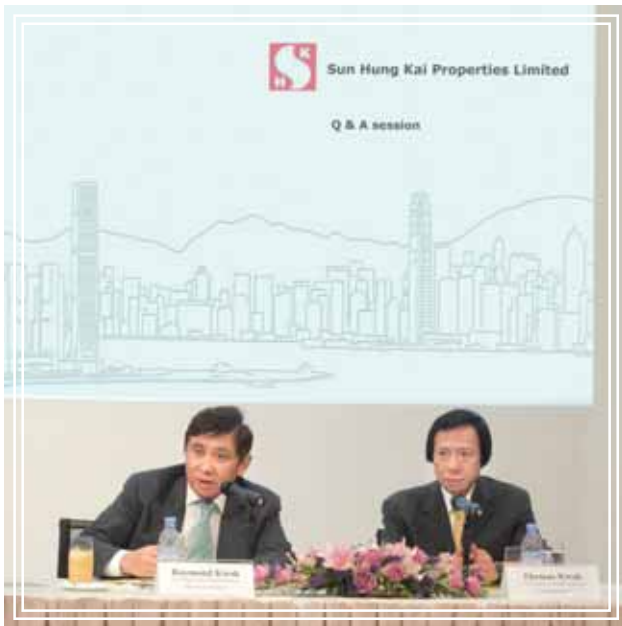
Group Vice Chairmen and Managing Directors Thomas Kwok (right) and Raymond Kwok (left) at an analyst briefing