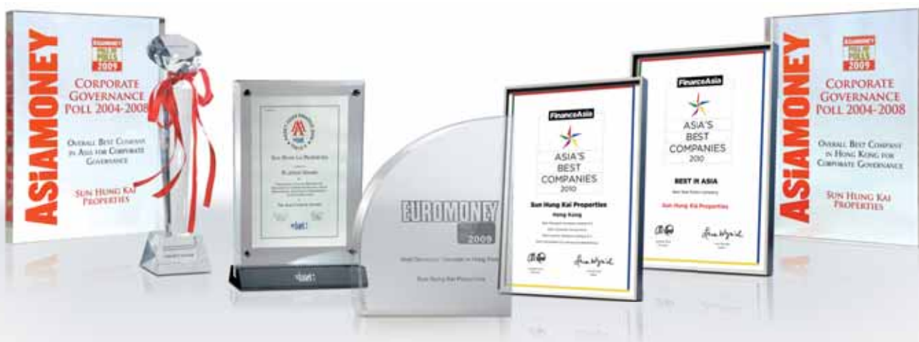
The Group won numerous awards from the financial sector in the year