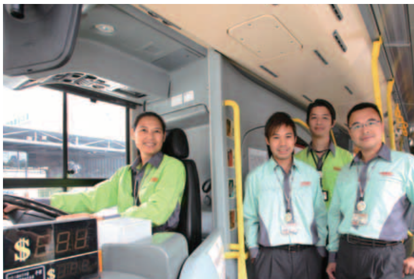
KMB's new uniform combines style and comfort

A Most Professional Bus Captain Election Campaign asking passengers to nominate the pick of our bus captains is being organised in January 2011 to recognise bus captains who provide outstanding service performance.