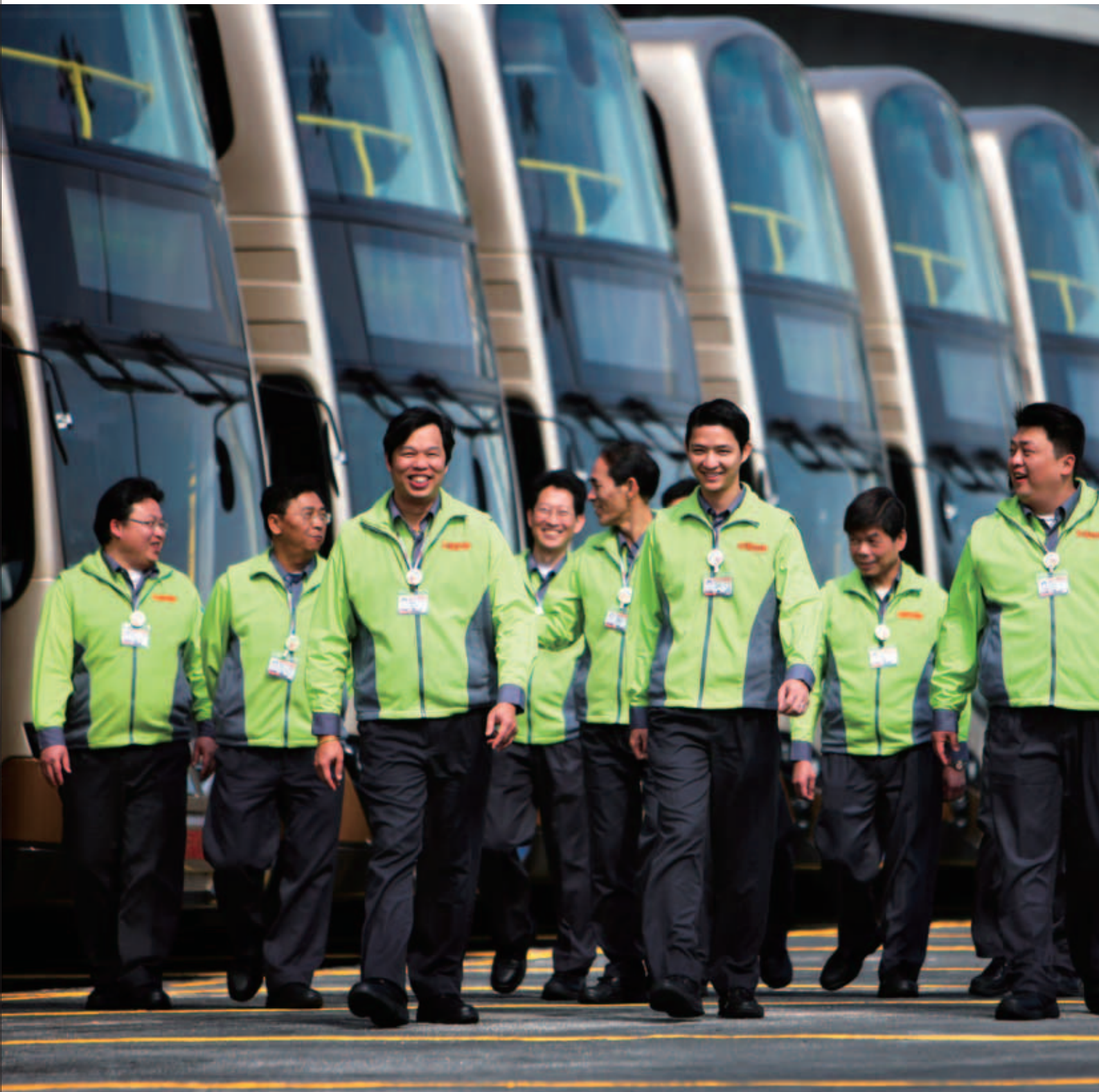
KMB's strong team of bus captains