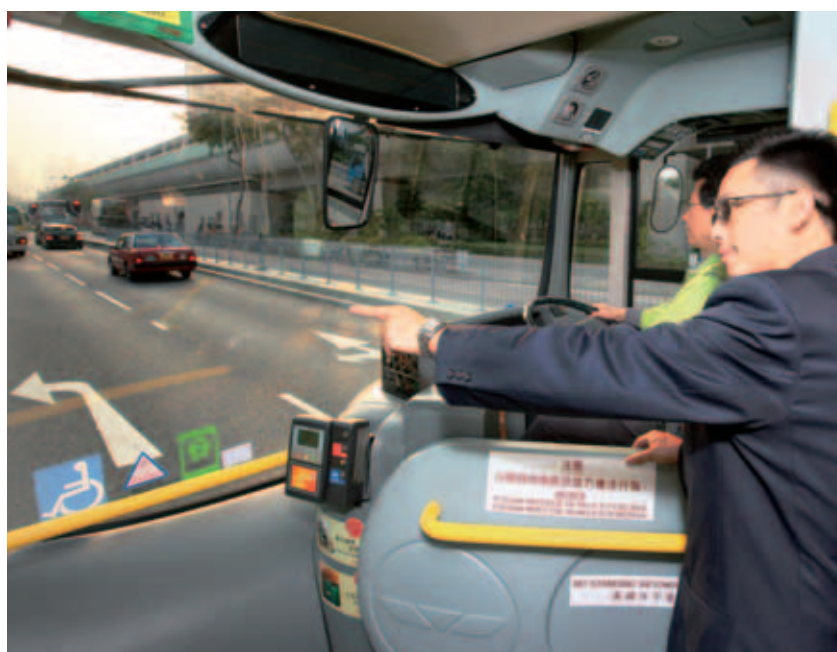
A trainee KMB bus captain receives on-road instruction

A large scale customer service training programme was recently organised for all operations and maintenance staff of KMB and LWB, drawing on the expertise of an established training consultancy firm. The "Service from the Heart" programme was tailor-made to develop a positive service mindset among staff and raise their awareness of customers' expectations of quality service. In the first phase of the programme, 52 seminars were held for more than 10,000 staff members in the fourth quarter of 2009. The second phase of the programme, held from January to April 2010 and consisting of more than 300 workshops with a focus on experiential learning for small groups of around 30 frontline staff, aimed to equip participants with the skills required to handle challenging customer service situations.