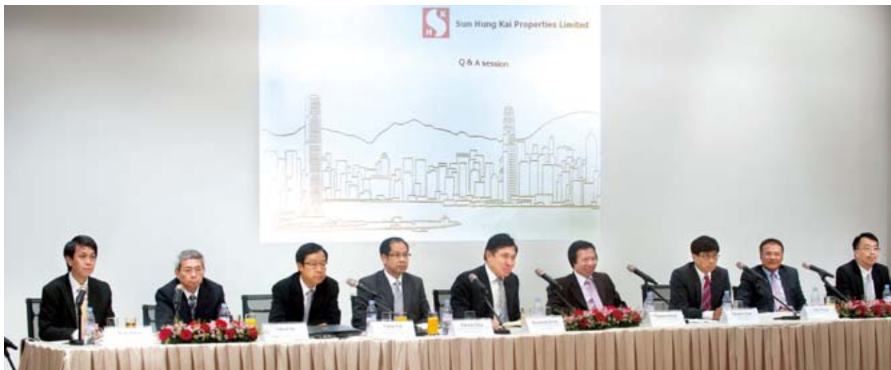
Senior management explaining the Group's business development at an analyst briefing

The Group places great importance on communicating its strategies, business development and prospects to shareholders and the investment community, maintaining effective two-way communication channels to promote greater understanding and transparency.