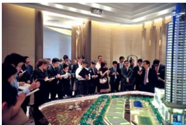
Visits to the Group's new projects are held for investors