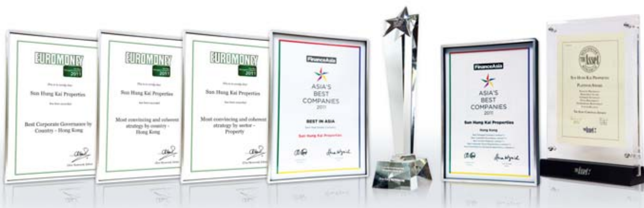
Numerous international awards for the Group during the year