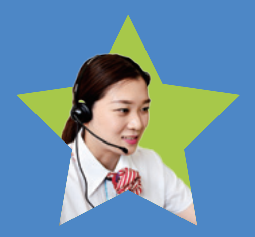
RAILWAY BUSINESSES IN THE MAINLAND OF CHINA