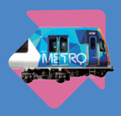
AUSTRALIAN RAILWAY BUSINESSES