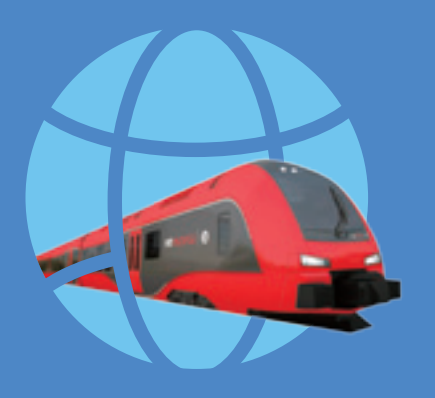
EUROPEAN RAILWAY BUSINESSES