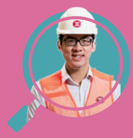
RECRUITMENT & RETENTION