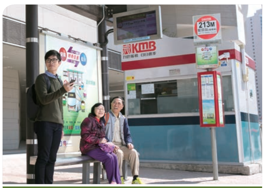
Passenger waiting areas have been upgraded with estimated time of arrival and benches

By end of 2016, we upgraded with additional facilities the passenger waiting area at a number of major hubs: the urban side of the Tai Lam Tunnel Bus-Bus Interchange, Tuen Mun Road Bus-Bus Interchange, Tsing Sha Highway Bus-Bus Interchange, Tate's Cairn Tunnel Bus-Bus Interchange, and busy bus stops at Lung Cheung Road in Wong Tai Sin. Besides LCD panels notifying passengers of the arrival time of the next bus, prominent rooftop signs, large graphic information boards, benches, standing seats and a free Wi-Fi service were added.