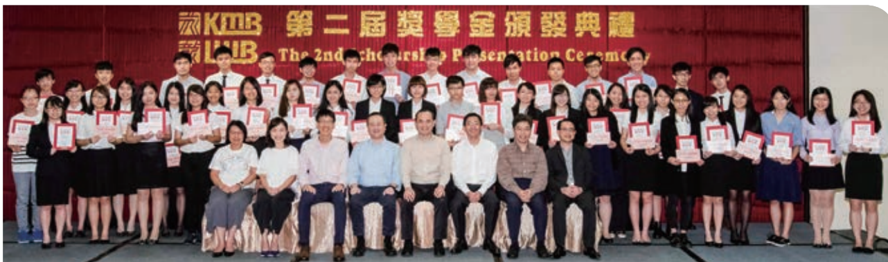
A scholarship scheme supports the tertiary education of children of staff