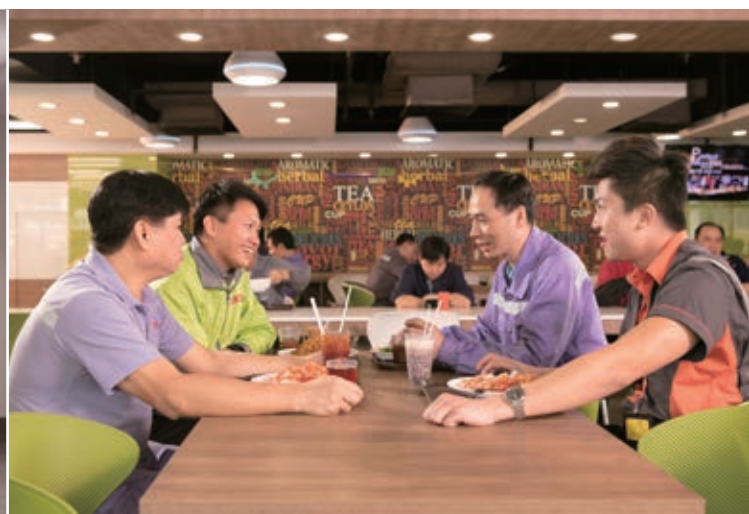
A gymnasium and renovated staff canteens improve the working environment