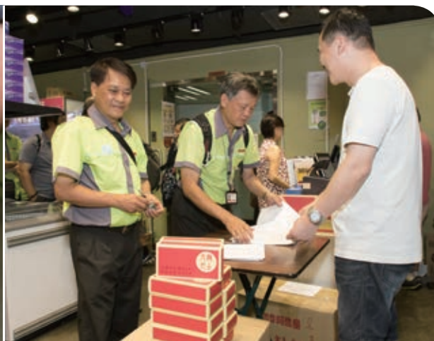
Rice dumpling and mooncakes were distributed to staff at Dragon Boat Festival and Mid-Autumn Festival