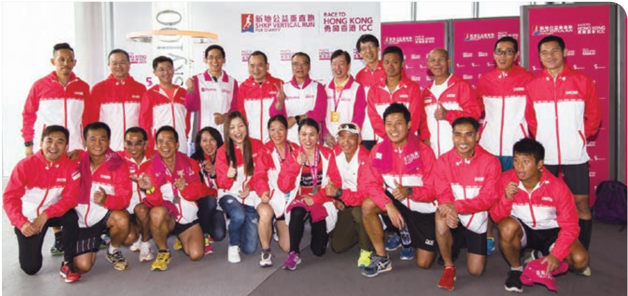
KMB teams participated in the Corporate Relay in the SHKP Vertical Run for Charity

apprenticeship training programme for youngsters who are interested in bus maintenance. In 2016, 17 apprentices graduated from the school, bringing the total of graduates since the school's establishment to 2,375. At the end of 2016, 195 apprentices were enrolled in the School's programme. Two engineering graduates completed the requirements of the Hong Kong Institution of Engineers Graduate Training in August 2016 and another two are still being trained in that programme. The quality of our apprentice training was once again recognised in 2016 with two KMB apprentices placing second runner-up and third runner-up respectively in the Vocational Training Council's Best Apprentice in the Automobile Trade Competition. Their reward was an invitation to visit the Toyota Motor Plant in Japan.