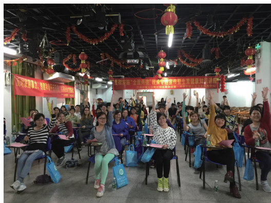
Social Policy Training for Women 婦女社會政策培訓