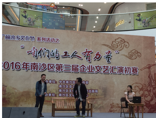
Community Activity 社區活動

Panyu plant has solicited policies to understand and support local community needs by using different means. Panyu plant joined the local community activities including respectful activities for senior people, entertainment performance for local community, visit and subsidizing money to poverty villagers, providing scholarships for outstanding middle school students and joined the local government-organized money raising activities for poverty by contributing money and employment of local residual manpower etc. (About RMB150,000.)