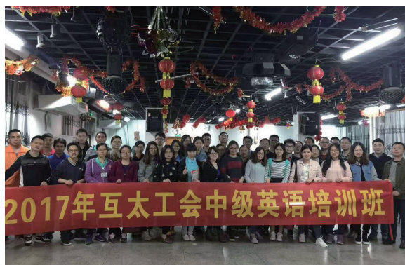
English Language Training 2017 2017年英語培訓