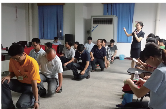
Effective Management Skill 高效的管理技能

番禺廠制定長期的政策及培訓計劃提高僱員的履職知識和技能。該等政策及計劃覆蓋普通工人的入職培訓以及大學水平、初級及中級水平僱員的內外部職業培訓。2016年，該等培訓活動亦包括「如何有效激發及管理新一代員工」、「高效的管理技能」及英越雙語培訓課程。總體而言，番禺廠員工每月人均培訓時數約為2.50（上年：1.96小時／月）。