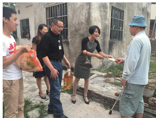
Poverty Subsidy Program 貧困資助計劃

番禺廠已通過不同方法徵集政策，了解及支持當地社區的需求。番禺廠參與了敬老活動、當地社區娛樂表演、拜訪及資助貧困村民、為優秀中學生提供獎學金等當地的社區活動，並通過捐款及僱傭當地剩餘勞動力等方式參加當地政府組織的救助貧困人士募捐活動（約人民幣150,000元）。