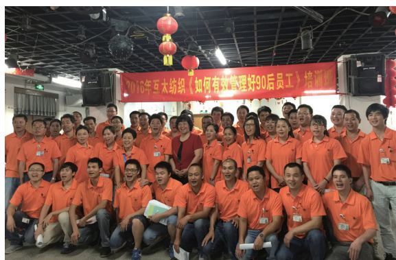
Managing Age at 90 Generation 管理90後員工

Vietnam plant provides orientation training: all newly hired employees are required to join the orientation training covering internal regulations on compensations and benefits, labor discipline, health and safety, firefighting, job and operational needs. Vietnam plant also provides annual training and irregular training: