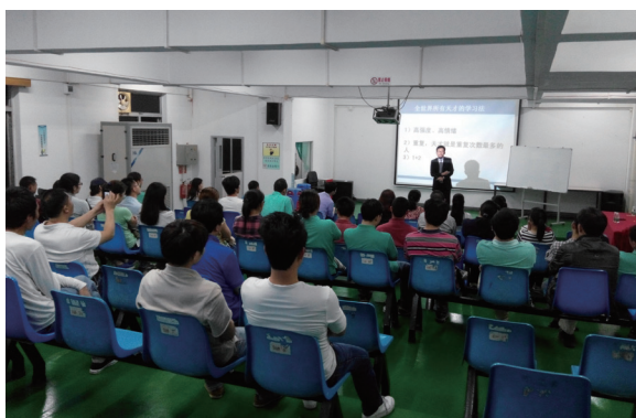
Learning Method Training 學習方法培訓