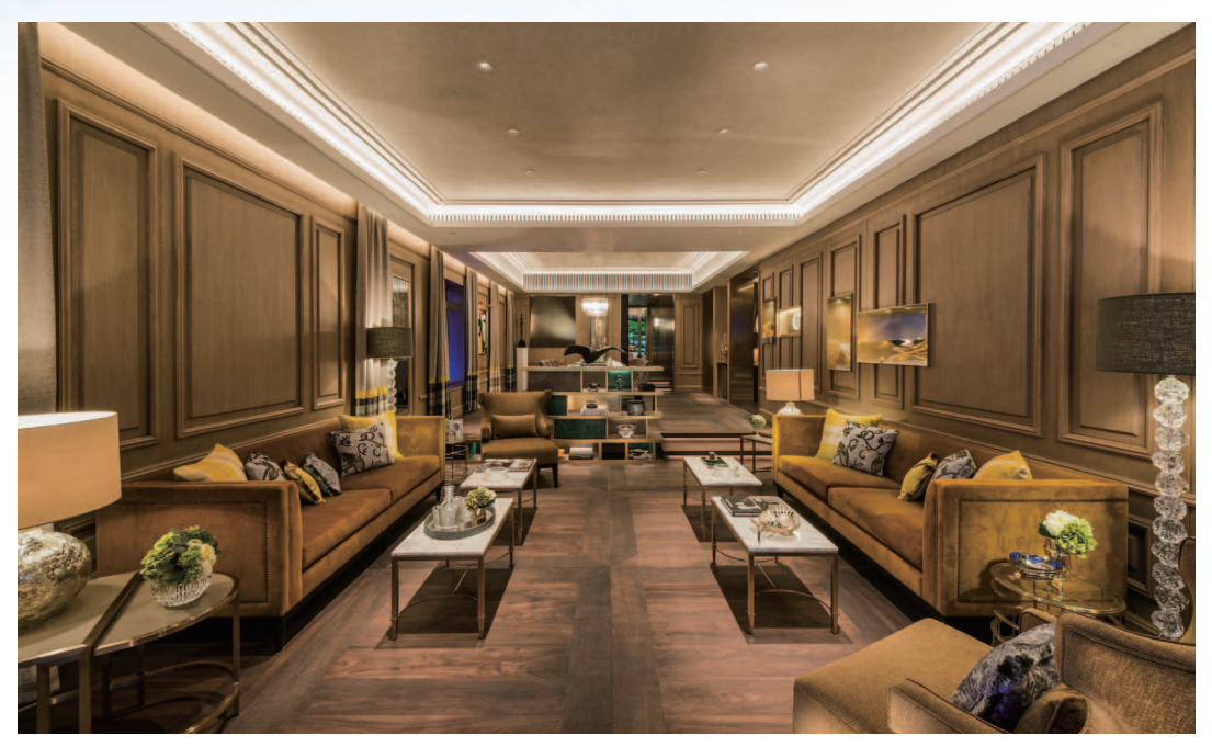
Sky Oasis 金峰名匯