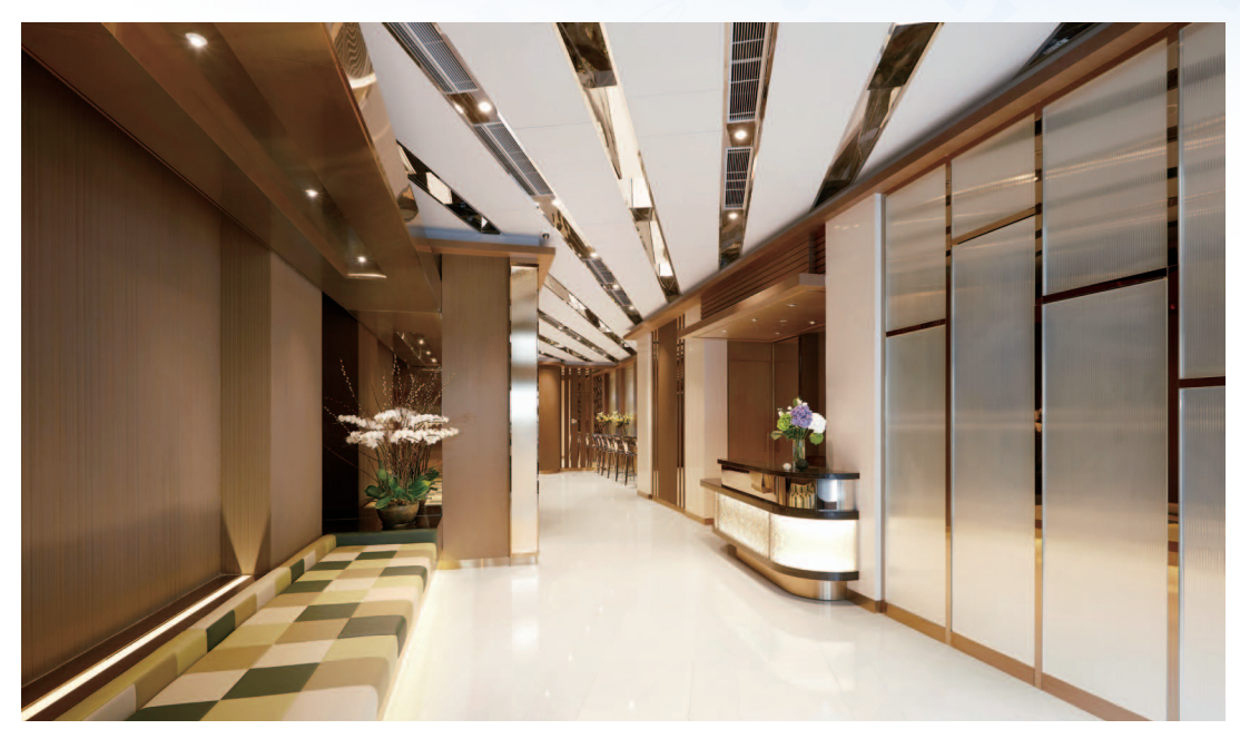
Le Petit Rosedale Hotel 珀麗尚品酒店