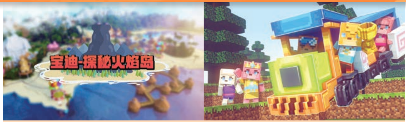
One of the first Chinese brands licensed to Minecraft and launched in January 2019.