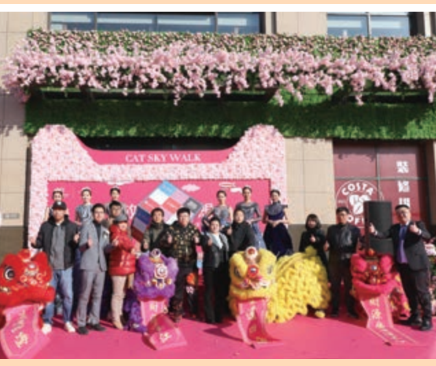
Cat Sky Walk, a shopping street in Regal Renaissance – Grand opening in December 2018