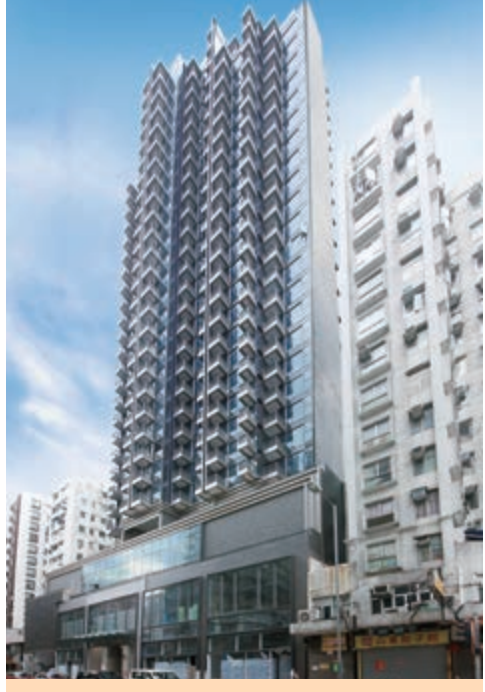
The Ascent, a commercial/residential development at No. 83 Shun Ning Road, Sham Shui Po, Kowloon – completed in July 2018