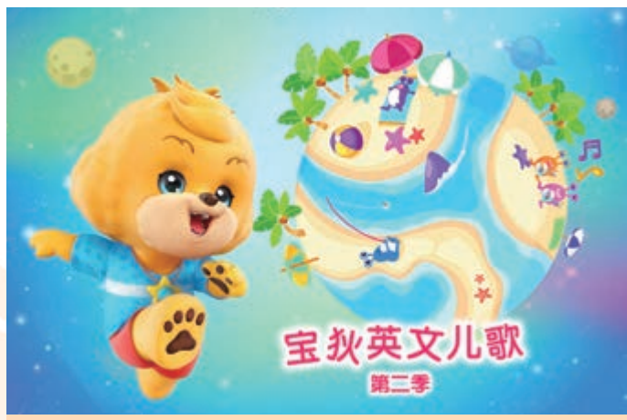
Bodhi Galaxy English was launched in BEVA and over 3 million views within 1st month.