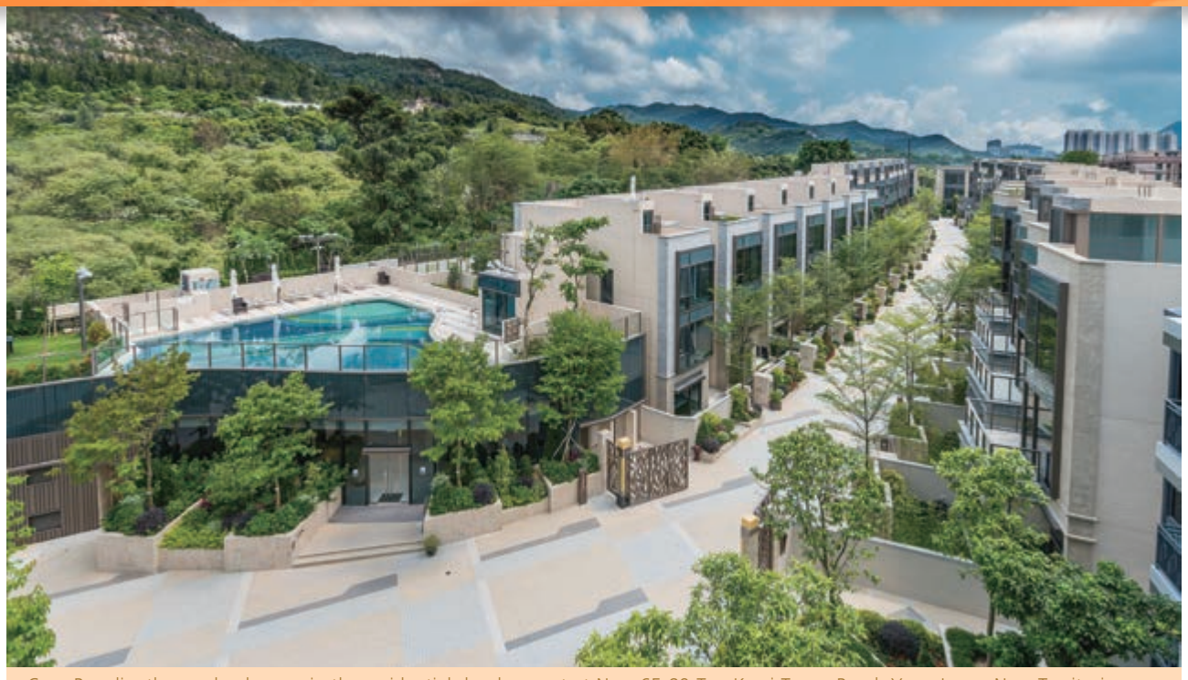
Casa Regalia, the garden houses in the residential development at Nos. 65-89 Tan Kwai Tsuen Road, Yuen Long, New Territories