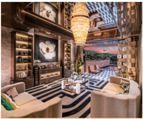
Living room of a garden house at Mount Regalia