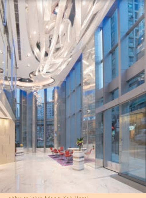
Lobby at iclub Mong Kok Hotel