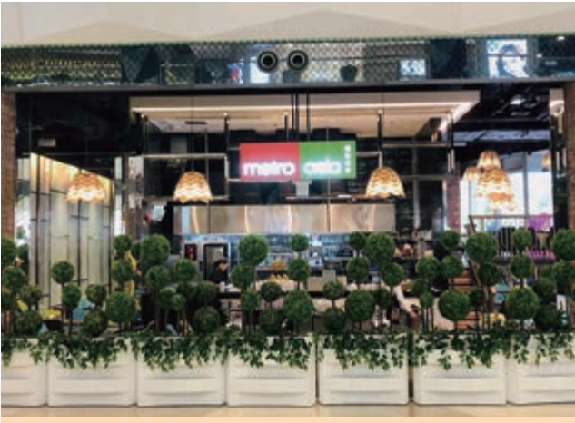
Metro Asia at We Go MALL