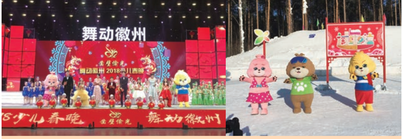
Participated in various Spring Festival Galas including CCTV, Anhui TV and Kaku.

Collaborated with KFC China for 2 consecutive years. Over 1.2 million books were distributed among 4,000+ restaurants in 2018.