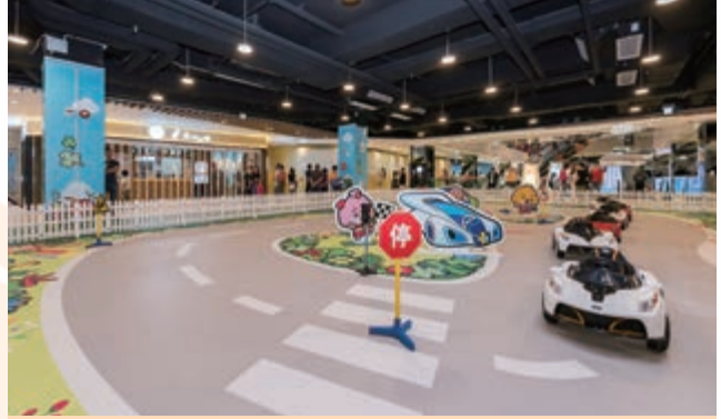
Racing Hero at We Go MALL