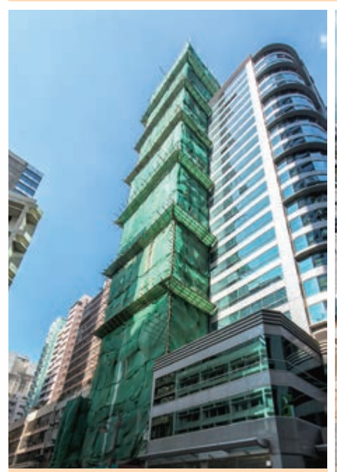
Nos. 5-7 Bonham Strand West and Nos. 169-171 Wing Lok Street, Sheung Wan intended to be named as "iclub Sheung Wan II Hotel" – superstructure works substantially finished