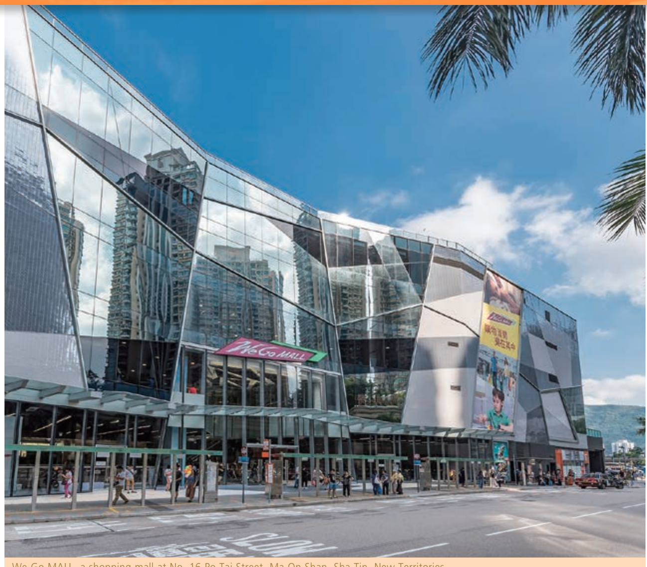
We Go MALL, a shopping mall at No. 16 Po Tai Street, Ma On Shan, Sha Tin, New Territories