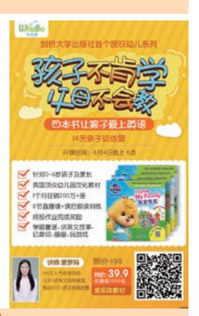
Developed 360 minutes of English video courses and were introduced via WeChat in April 2018