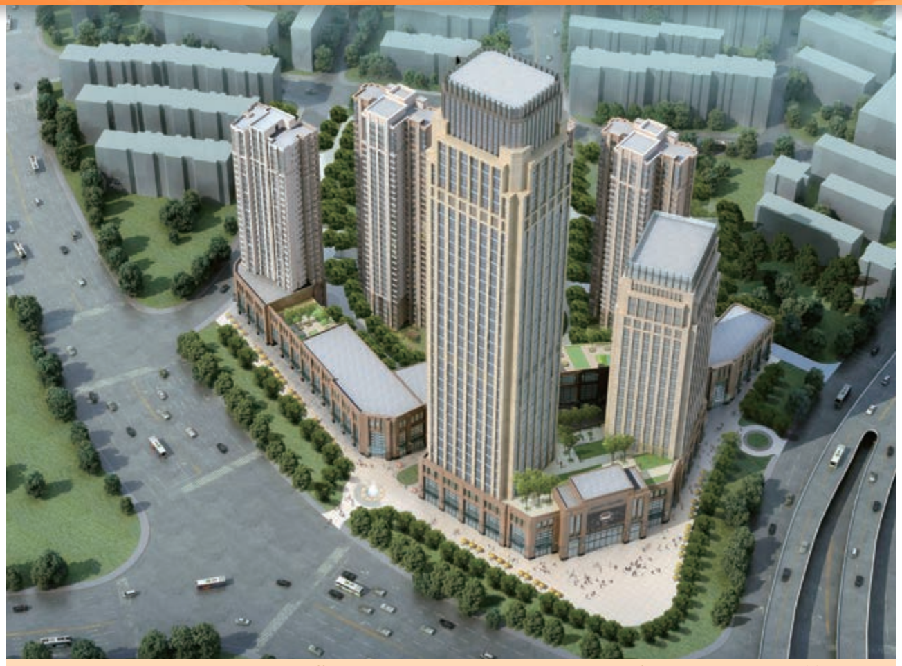
Regal Renaissance, a composite commercial/office/residential development in a prime location of Hedong District, Tianjin (*)