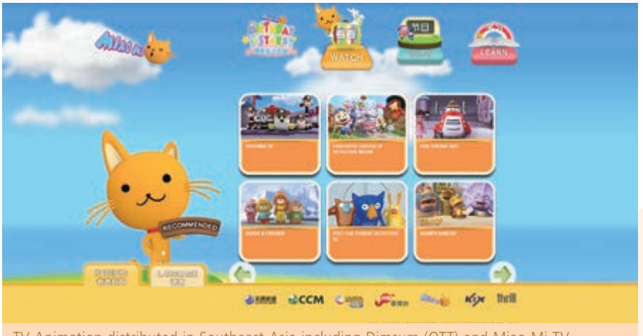
\ensuremath{\mathsf{TV}} Animation distributed in Southeast Asia including Dimsum (OTT) and Miao Mi \ensuremath{\mathsf{TV}}.