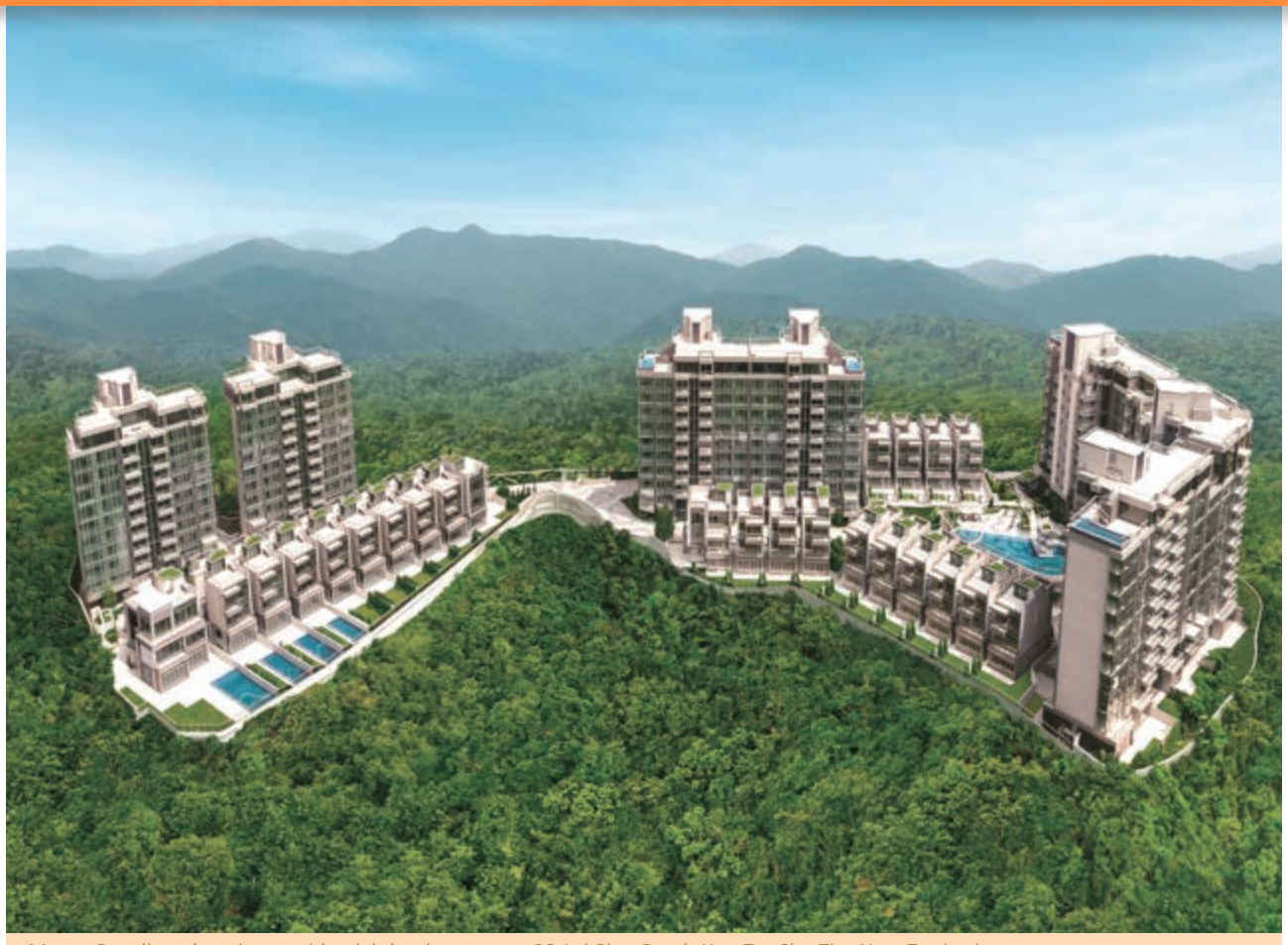
Mount Regalia, a luxurious residential development at 23 Lai Ping Road, Kau To. Sha Tin, New Territories