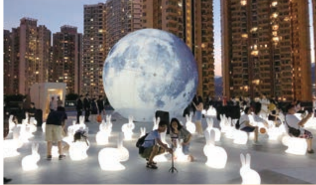
We Go MALL – garden roof