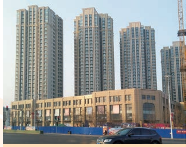
Residential towers and commercial complex of Regal Renaissance - completed