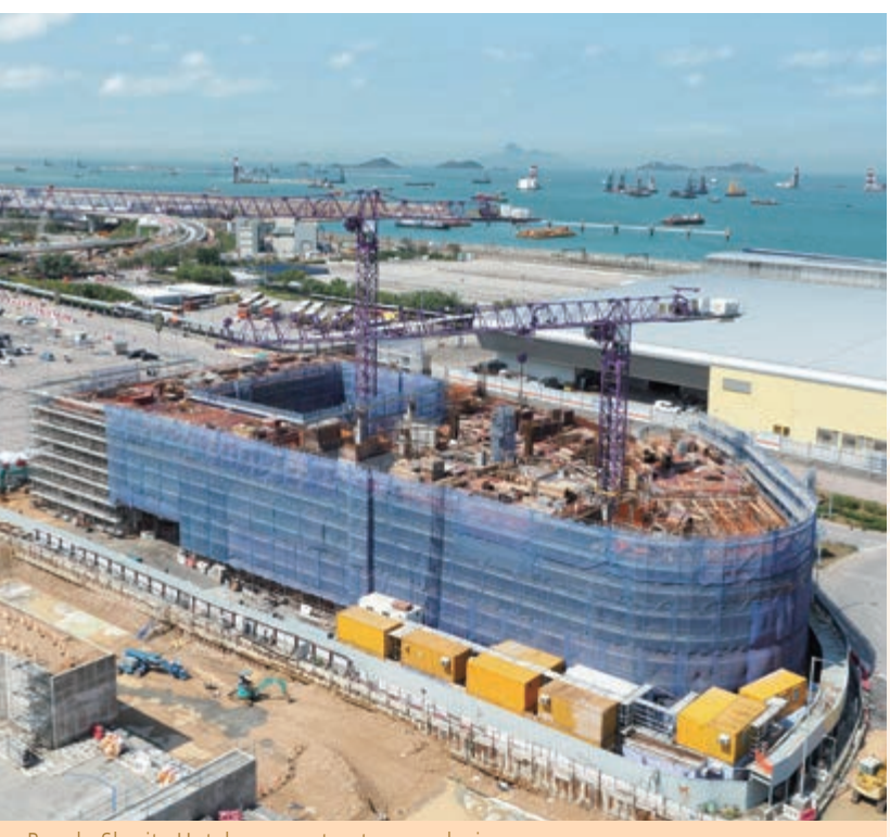
Regala Skycity Hotel – superstructure works in progress