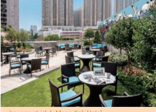
iLounge at iclub Mong Kok Hotel