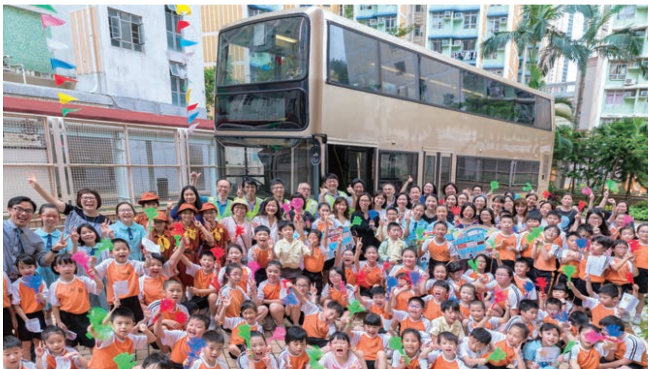
○ The Donation of Used and Retired Bus Programme is well received by teachers and students