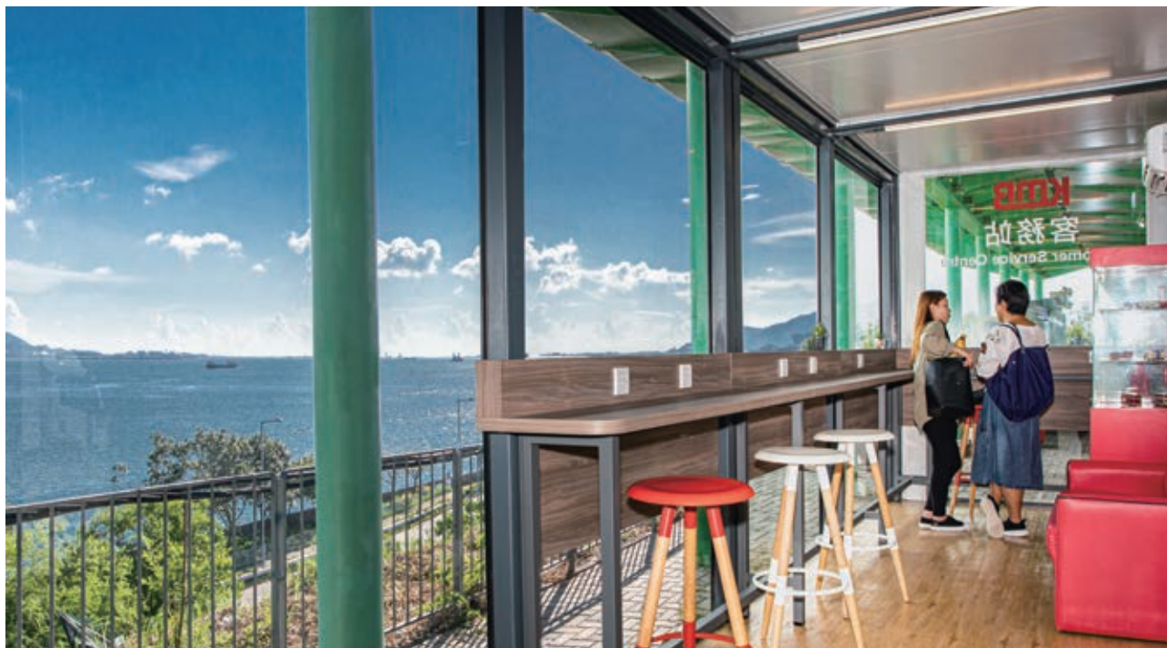
The Customer Service Centre at the Tuen Mun Road Bus-Bus Interchange provides passengers waiting for buses with caring services