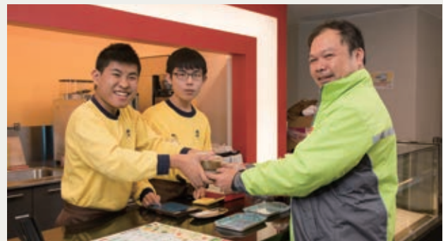
○ Students prepare ingredients, make coffee and handle orders and cash transactions under the guidance of their teachers.