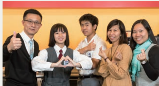
○ KMB Café1933, a staff coffee shop, offers food and beverage for patrons and retail placement for students from four Hong Chi Association Special Schools.

Committed to corporate social responsibility and bringing about an inclusive working environment, KMB leverages its resources to help the community. To further its Business-School Partnership, Café1933, a staff coffee shop, has joined hands with Hong Chi Association (HCA) to offer food and beverage for patrons and retail placement for students from four HCA Special Schools to unleash their potential. Students prepare ingredients, make coffee and handle orders and cash transactions under the guidance of their teachers, which improves their communication and work skills, and helps equip them to integrate into the community with an independent approach. In addition to helping those with disabilities and special educational needs, KMB also uses its resources to benefit the youth, including donating used buses under the Donation of Used and Retired Bus Programme.