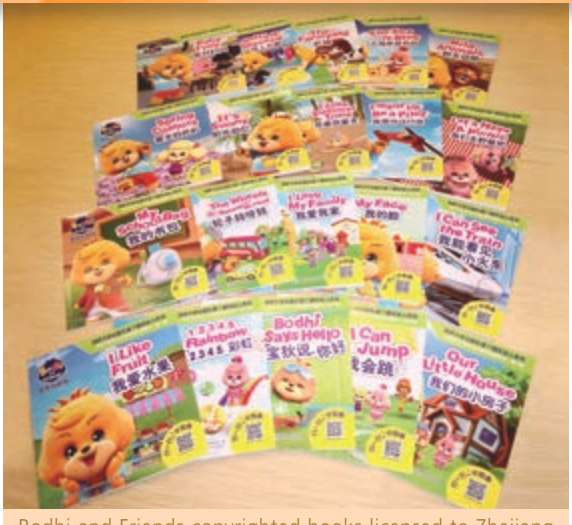
Bodhi and Friends copyrighted books licensed to Zhejiang Juvenile and Children's Publishing House for printing and sales - The 20-book series will be launched in 2020.