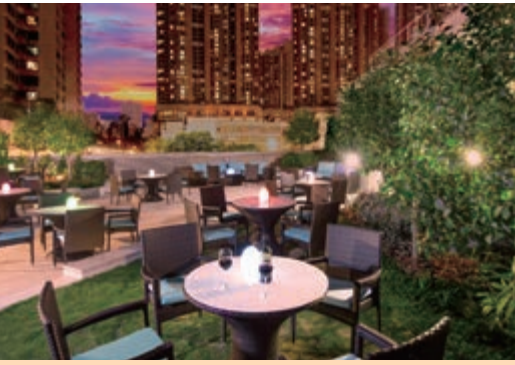
iLounge at iclub Mong Kok Hotel