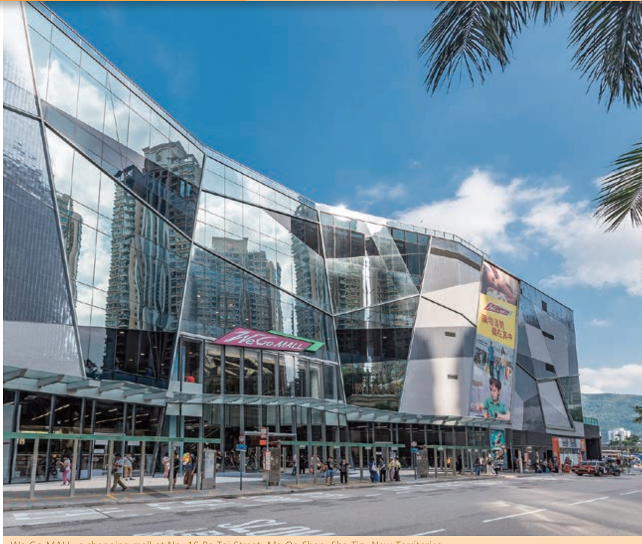
We Go MALL, a shopping mall at No. 16 Po Tai Street, Ma On Shan, Sha Tin, New Territories