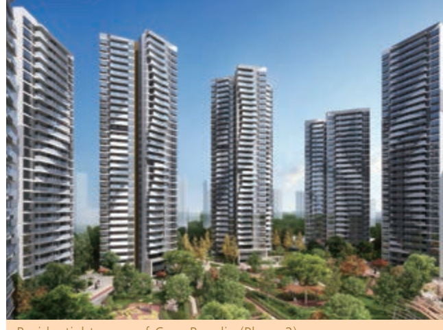
Residential towers of Casa Regalia (Phase 2), Regal Cosmopolitan City (*)