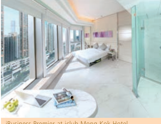
iBusiness Premier at iclub Mong Kok Hotel