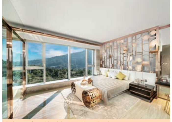
Bedroom of a residential unit at Mount Regalia