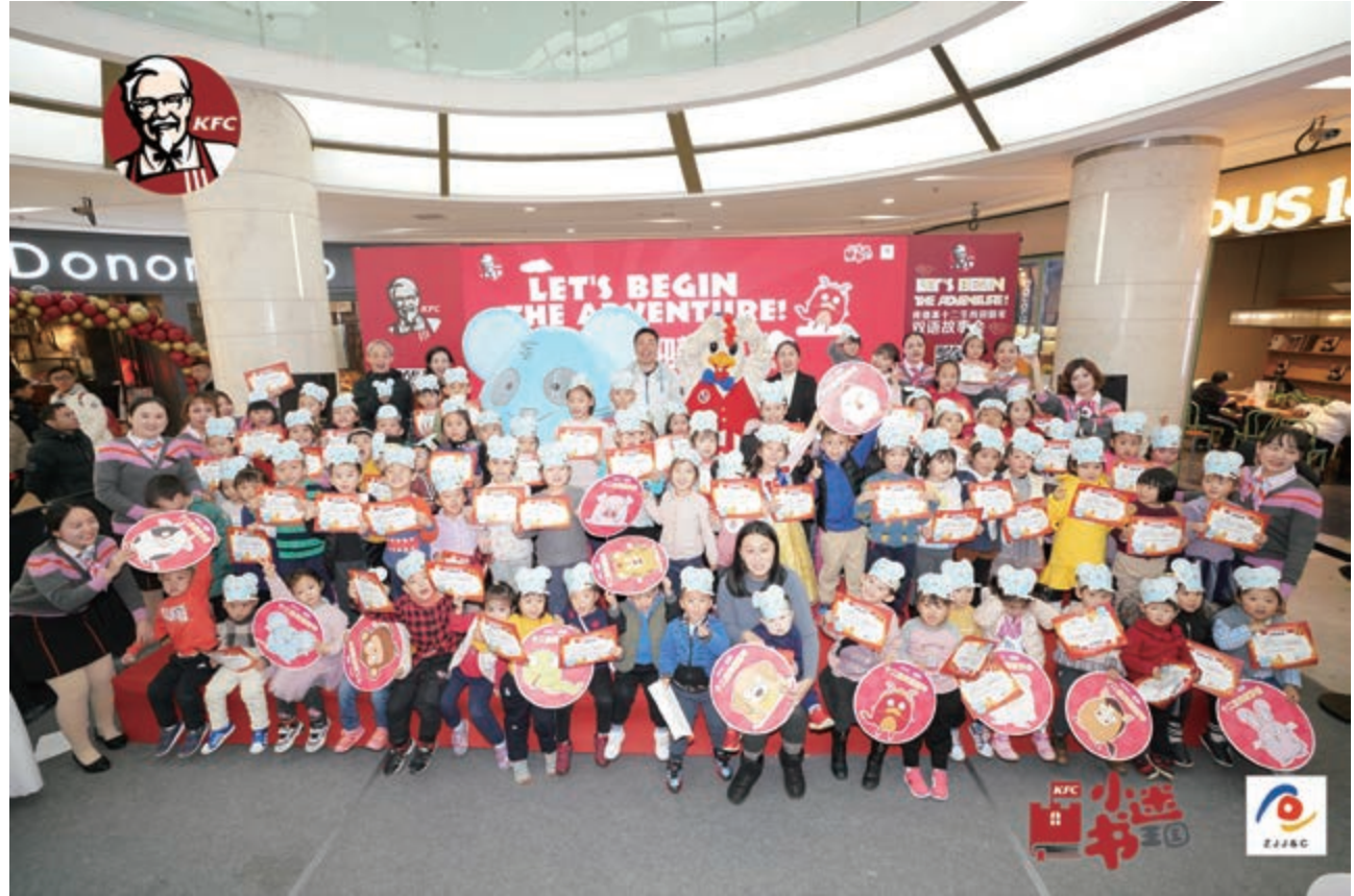
Collaborated with KFC China for 3 consecutive years in running offline reading promotion program Over 1.6 million books were distributed among 4,000+ restaurants in 2019.