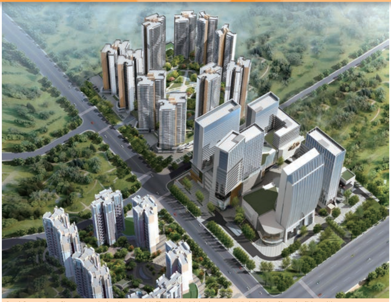
Regal Cosmopolitan City, a composite hotel/commercial/office/residential development in Xindu District, Chengdu, Sichuan (*)