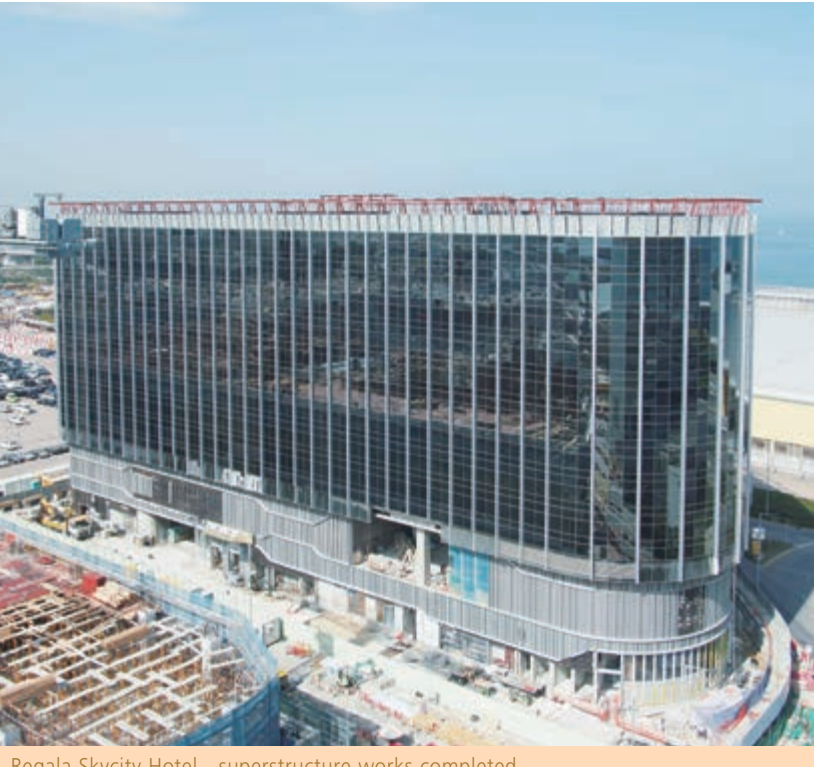
Regala Skycity Hotel - superstructure works completed