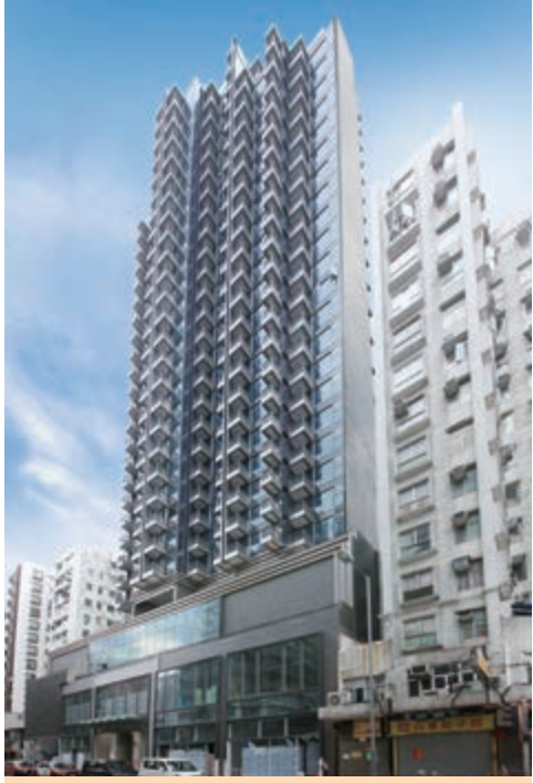
The Ascent, a commercial/residential development at No. 83 Shun Ning Road, Sham Shui Po, Kowloon