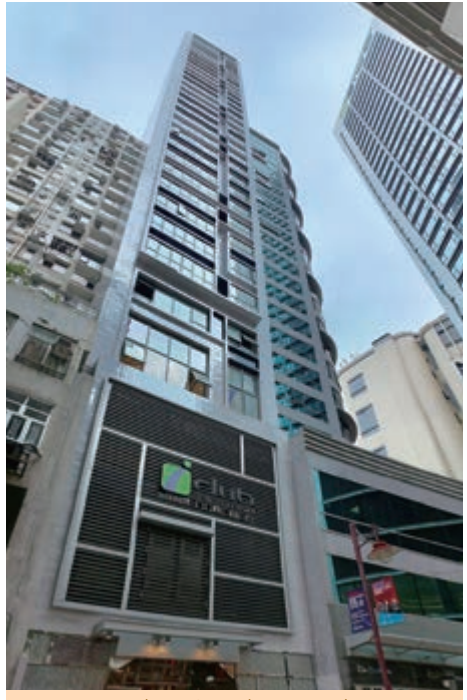
Nos. 5-7 Bonham Strand West and Nos. 169-171 Wing Lok Street, Sheung Wan to be named as "iclub Sheung Wan II Hotel"