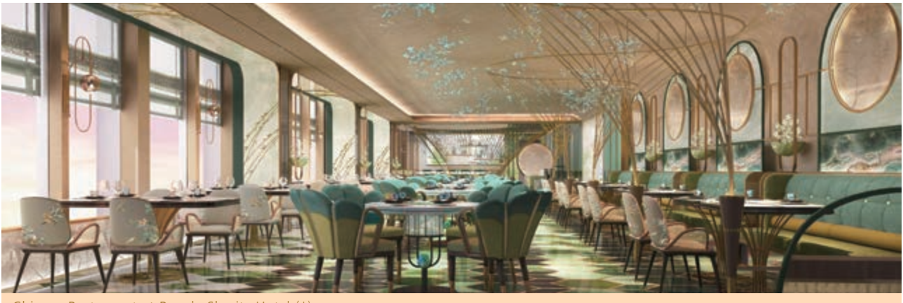
Chinese Restaurant at Regala Skycity Hotel (*)