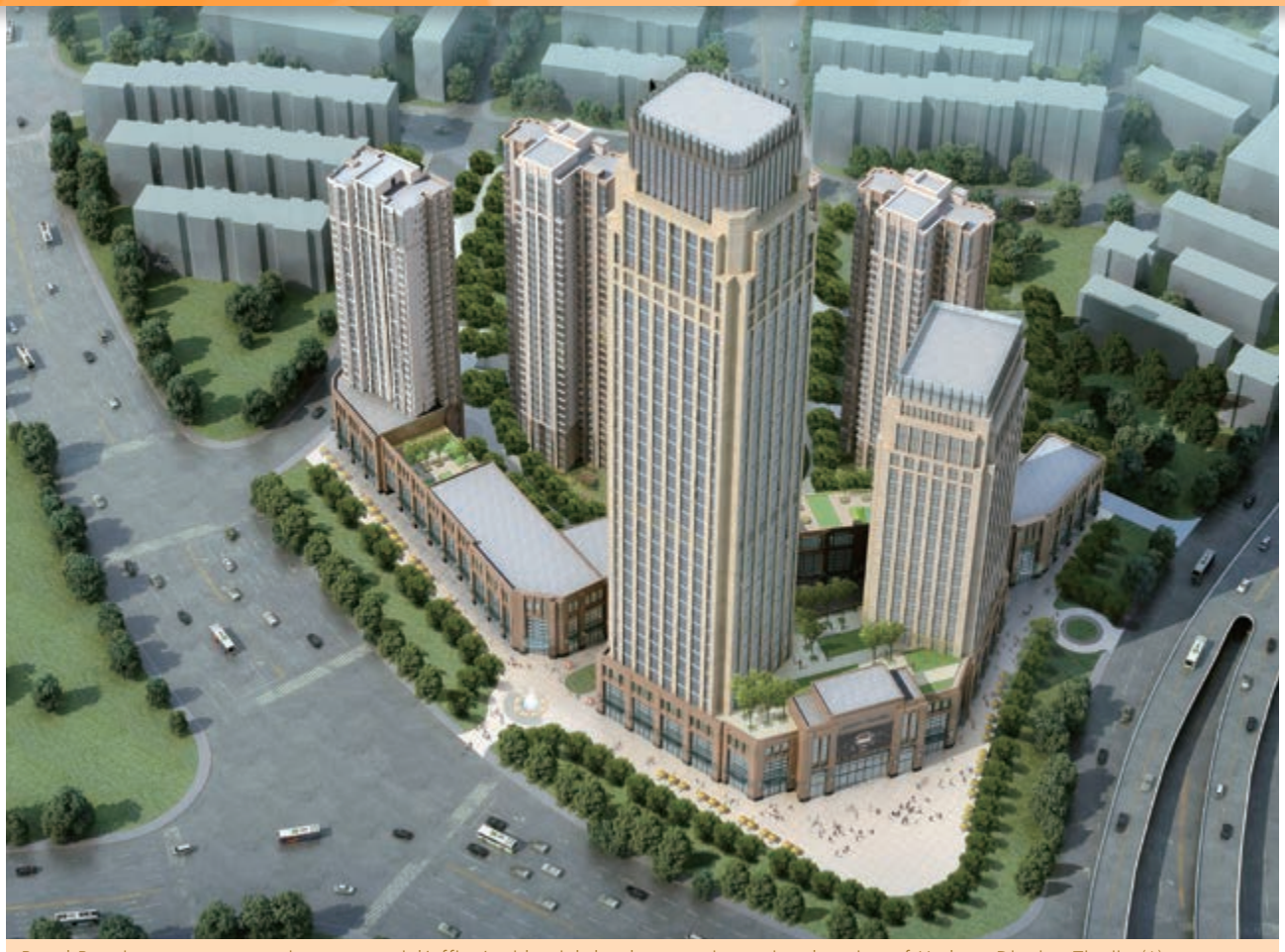
Regal Renaissance, a composite commercial/office/residential development in a prime location of Hedong District, Tianjin (*)