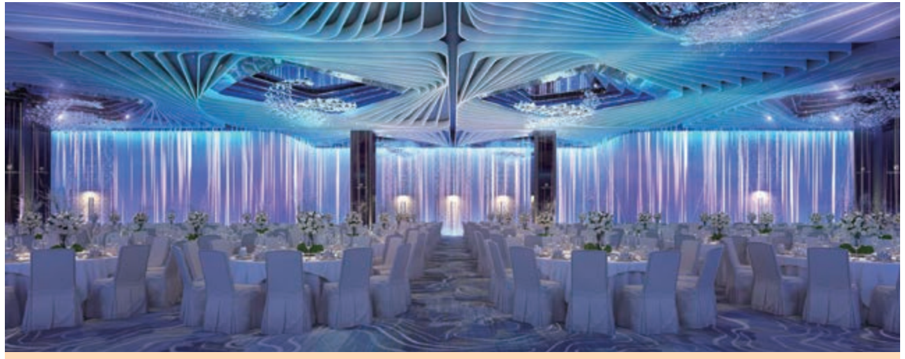
Banquet Hall at Regala Skycity Hotel (*)