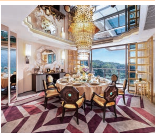
Dining room of a garden house at Mount Regalia