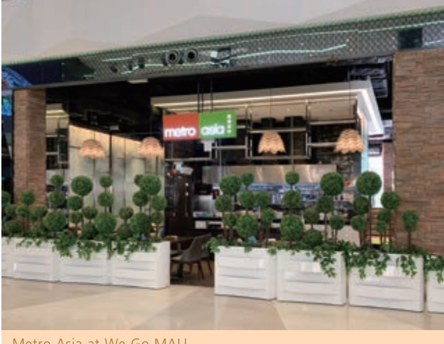
Metro Asia at We Go MALL