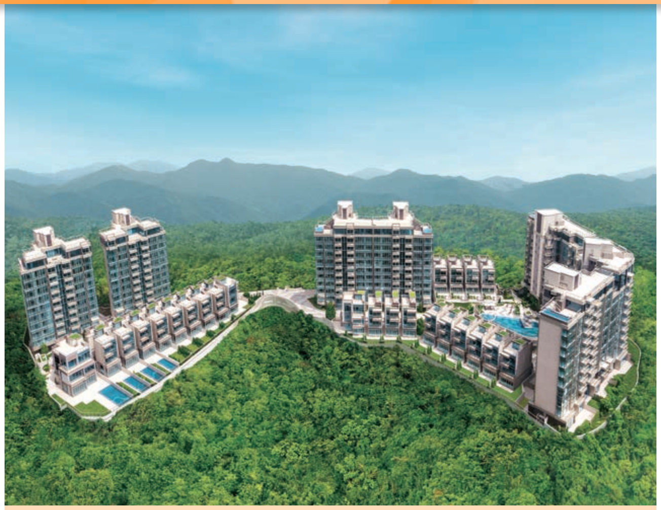
Mount Regalia, a luxurious residential development at 23 Lai Ping Road, Kau To, Sha Tin, New Territories