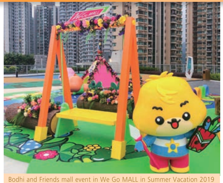
Bodhi and Friends mall event in We Go MALL in Summer Vacation 2019