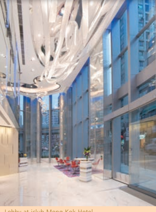
Lobby at iclub Mong Kok Hotel