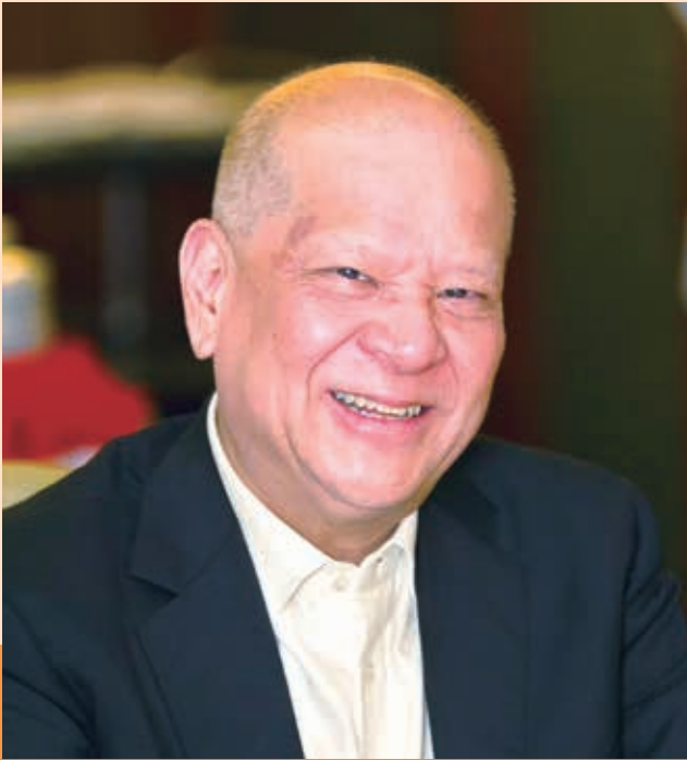
Ramon S. Ang 蔡啓文 Chairman 主席