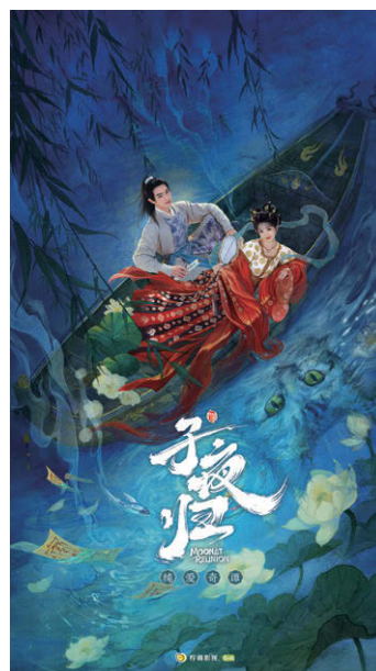
“Moonlit Reunion” (《子夜歸》)