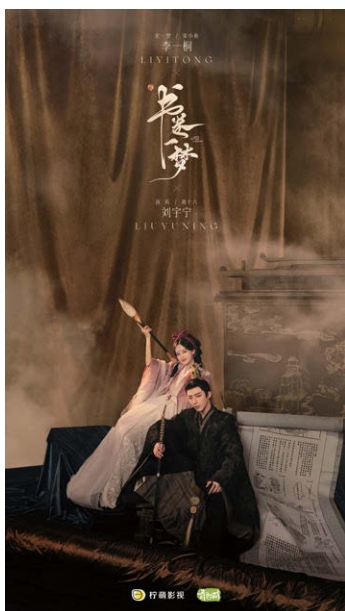
“A Dream within a Dream” (《書卷一夢》)