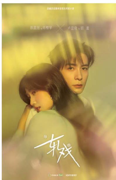
“Juggling Roles/Ga Xi” (《軋戲》)