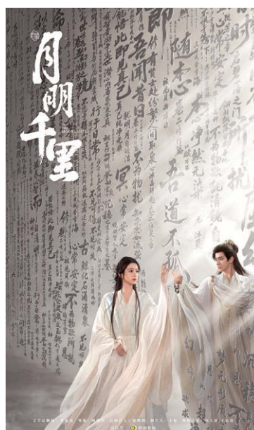
“In the Moonlight” (《月明千里》)