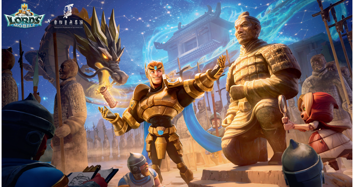
Lords Mobile's collaboration with the Emperor Qinshihuang's Mausoleum Site Museum