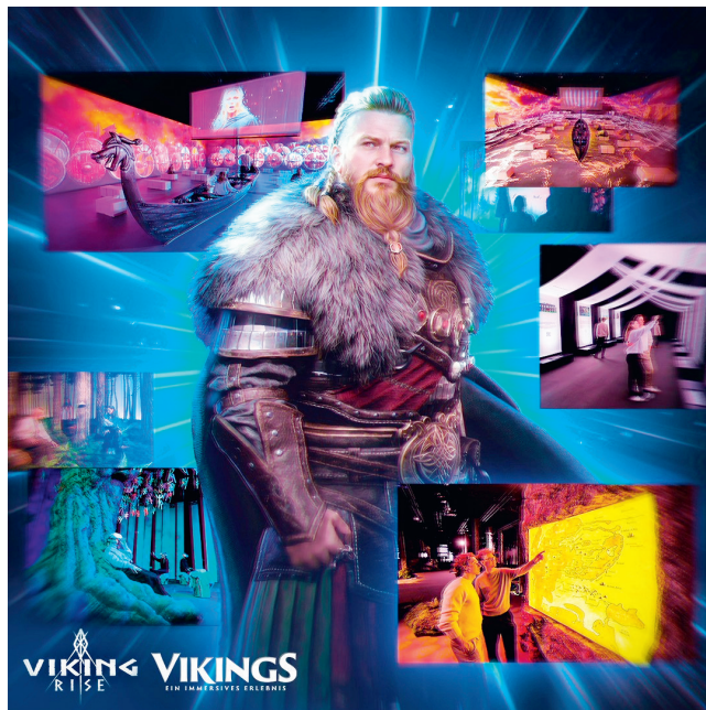
Viking Rise's collaboration with immersive exhibition "Vikings – Explorers and Conquerors"