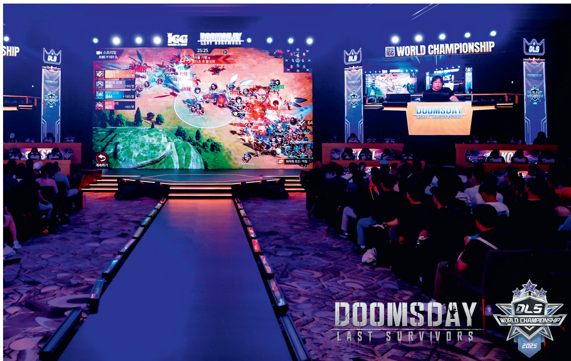
Doomsday: Last Survivors 2025 World Championship

In 2025, we remained committed to elevating player experience and rolled out a diverse range of player engaging events across multiple countries and regions, delivering world-class esports spectacles while fostering close connections with our players. “Lords Mobile”, “Doomsday: Last Survivors” and “Viking Rise” came together to stage the flagship esports annual event “2025 World Championship”. Following months of intense online qualifiers that drew thousands of teams from across the globe, top players have earned their spots to compete in Incheon, Korea, chasing championship glory and a generous prize pool. The tournament features a range of innovative formats and gameplays, combining strategic depth with spectator appeal. It also offers a premium viewing experience and immersive interactive activities, creating an unparalleled esports spectacle for players worldwide. In major cities around the world, we also held a variety of distinctive offline meetups and themed events, as well as attended game exhibitions, deepening interactions with players worldwide.