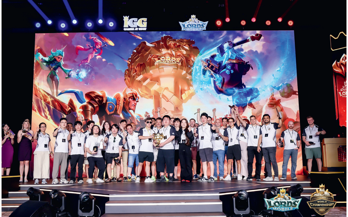
Lords Mobile 2025 World Championship