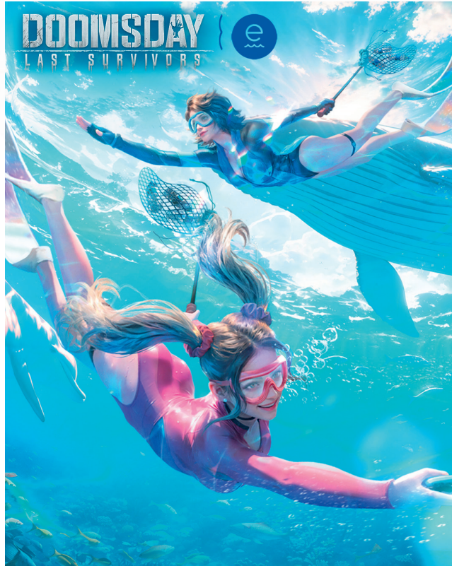
Doomsday: Last Survivors' collaboration with Ecomar in marine conservation