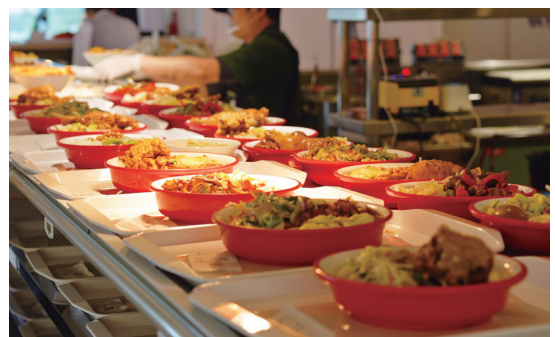
Comfortable Office Environment