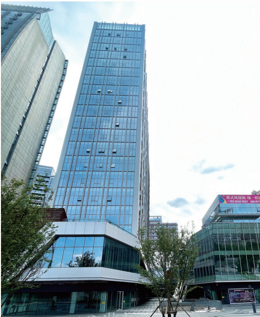
Hotel and commercial/office towers