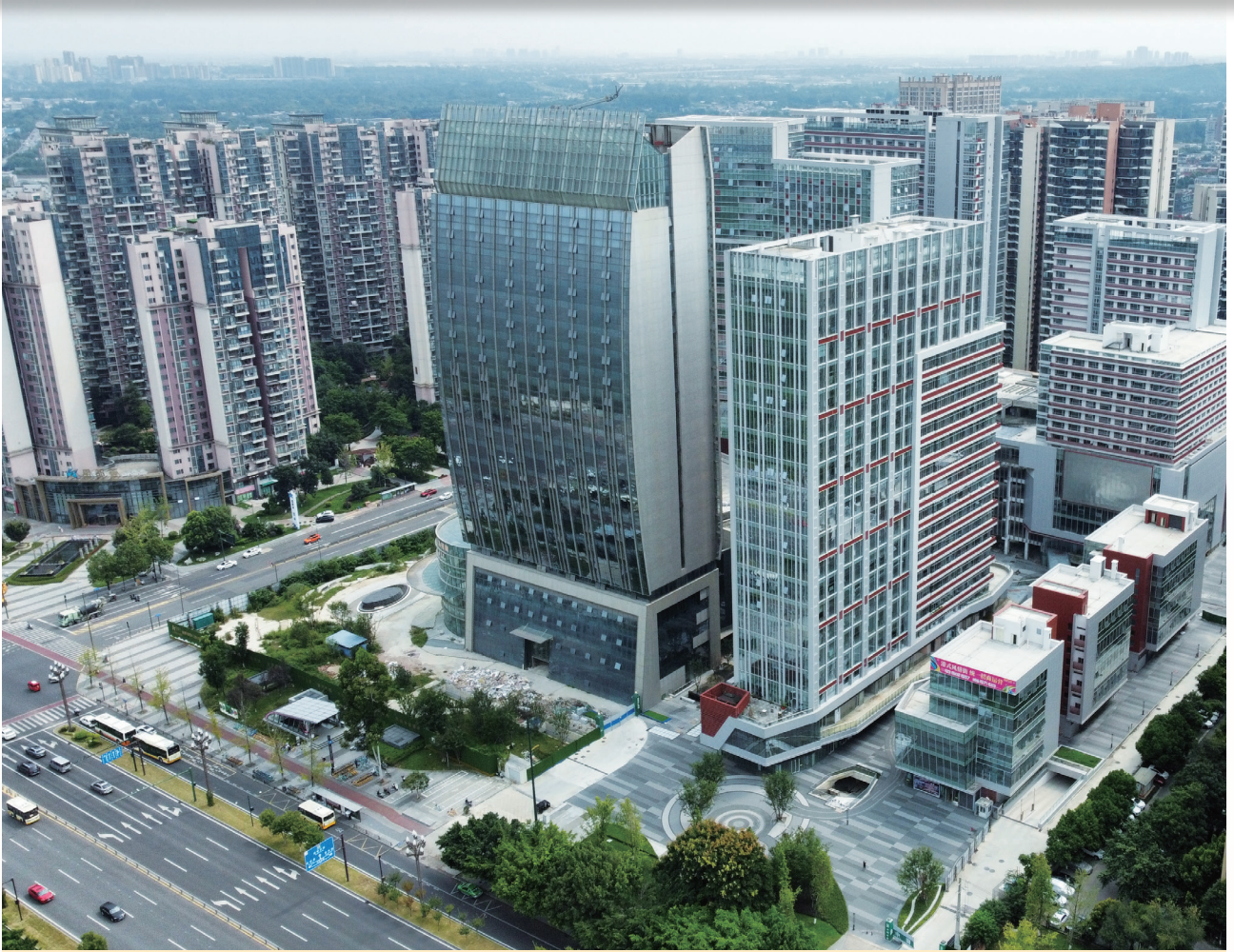
Regal Cosmopolitan City - Hotel and commercial/office towers