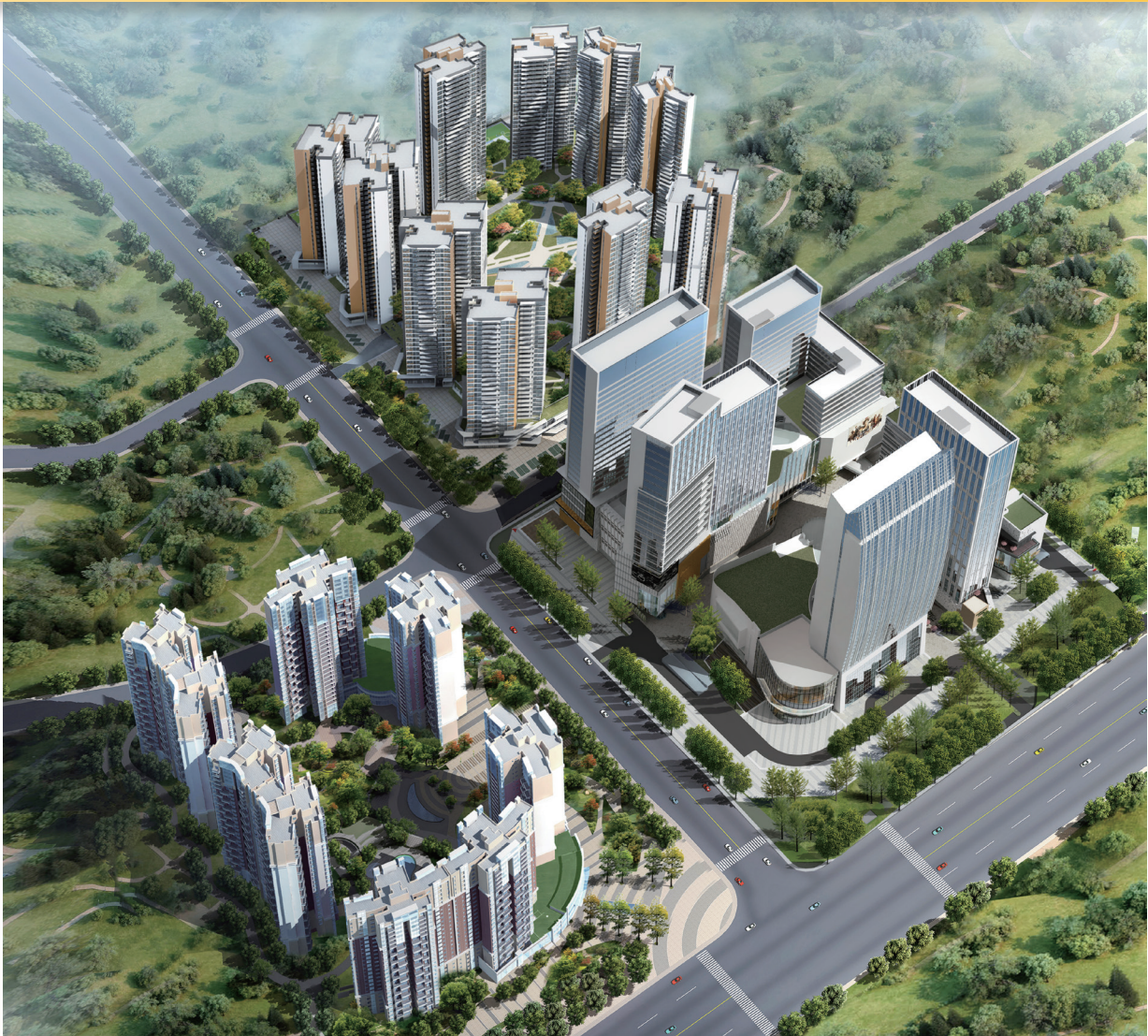
Regal Cosmopolitan City, a composite residential/commercial/office/hotel development in Xindu District, Chengdu, Sichuan