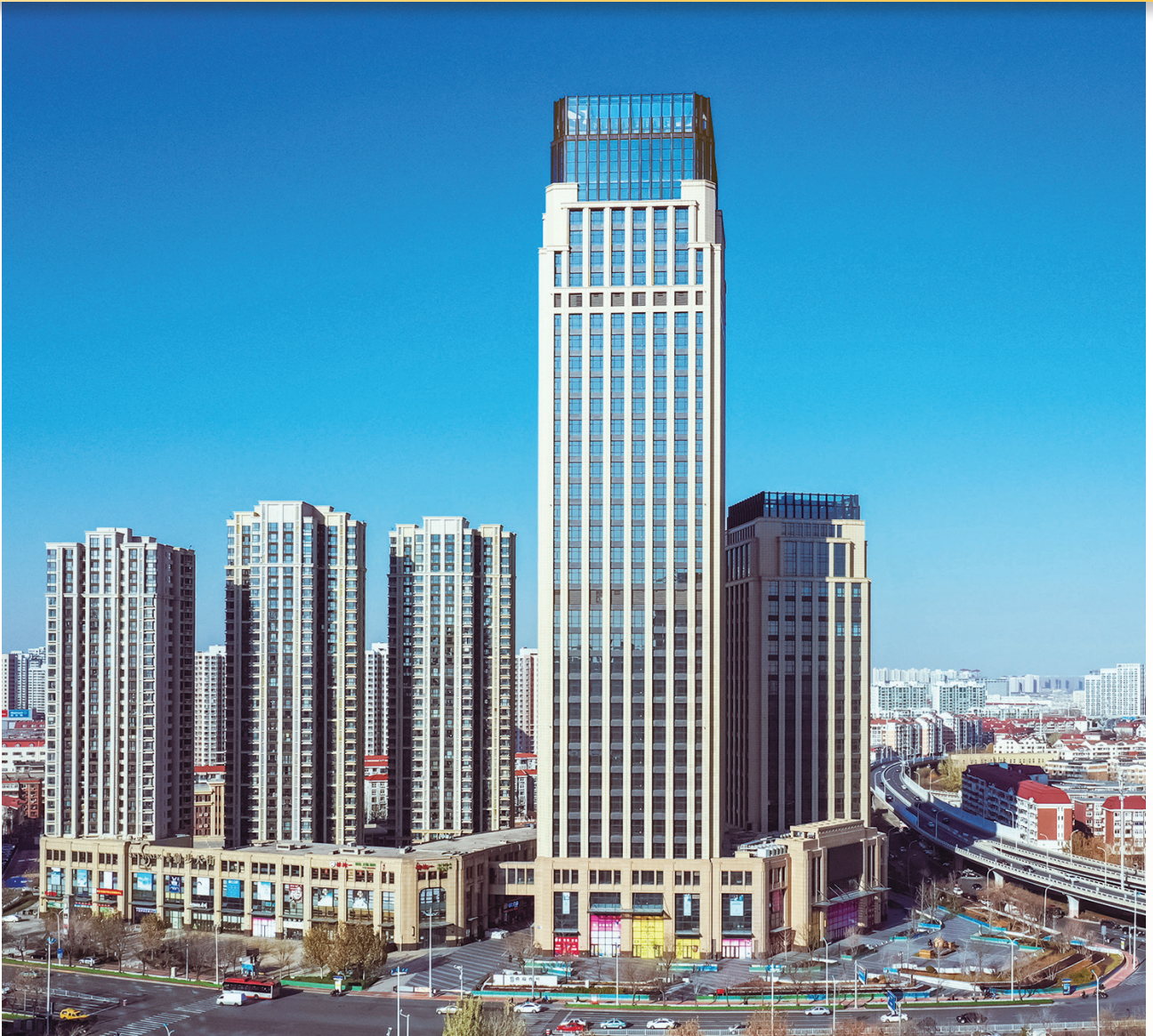
Regal Renaissance, a composite commercial/office/residential development in a prime location of Hedong District, Tianjin