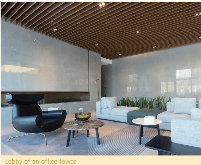
Lobby of an office tower