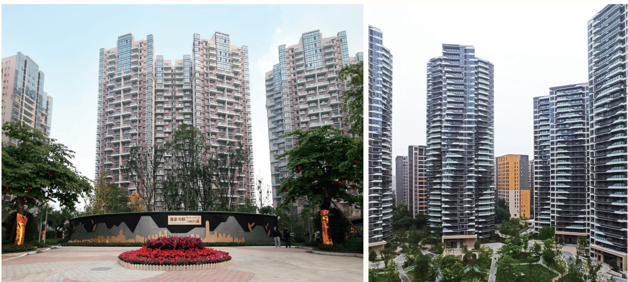
Casa Regalia (Phase 1 and Phase 2) - residential component of Regal Cosmopolitan City